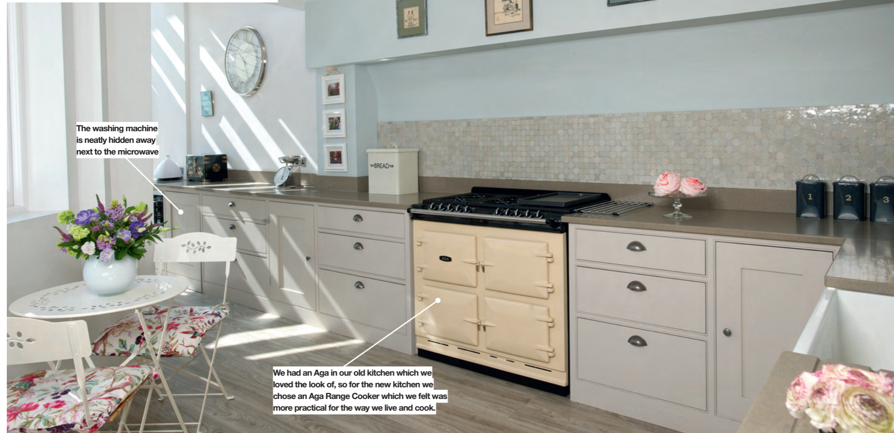
The washing machine is neatly hidden away next to the microwave