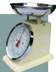
Cream Enamel Bread Bin, £26.99, www.giftedpenguin.co.uk