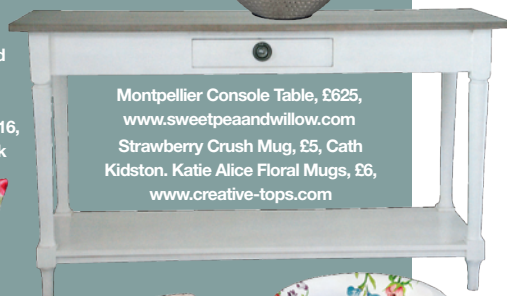
Montpellier Console Table, £625, www.sweetpeaandwillow.com Strawberry Crush Mug, £5, Cath Kidston. Katie Alice Floral Mugs, £6, www.creative-tops.com