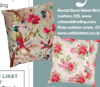
Nordal Sand Velvet Bird cushion, £25, www.cotswoldtrading.com . Rose cushion cover, £16, www.cathkidston.co.uk

"Now it's a much more pleasant place to hang out. The kids often have breakfast at this table and when friends come round for coffee they end up sitting there"