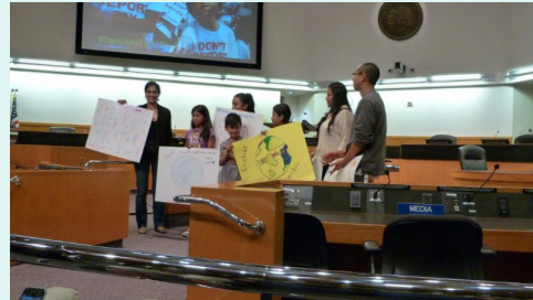
Community members using artwork to persuade the panel of judges in "Our Day in Court"