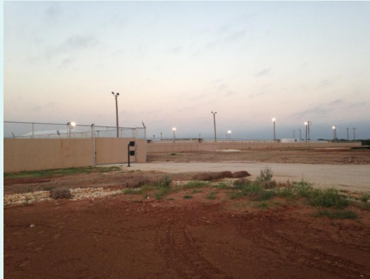
View outside the Dilley South Texas Family Detention Center