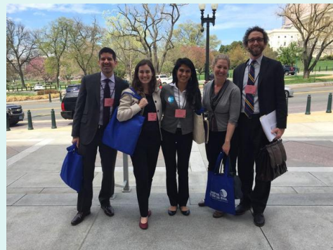
Pangea attorneys and AILA NorCal members advocating on the Hill