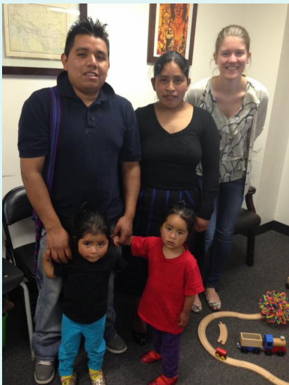
Celebrating a family reunification win for a successful removal defense case.

We are thrilled to report that this quarter, 23 Pangea clients were granted immigration relief (including 10 asylum grants and a complex DACA grant in removal proceedings); and 2 detained Pangea clients were released and reunited with their families.