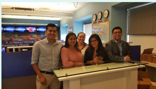
Pangea interns and OCEIA DreamSF fellows at Univision 14 headquarters