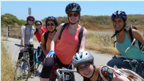
Pangea staff and interns enjoying a team fun day this June.