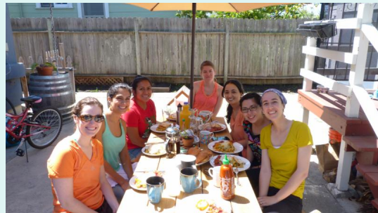
Pangea staff and interns enjoying a team fun day this June.

We envision a world where the fundamental right to move is respected and appreciated by all. Our view is that all human beings are entitled to respect, documents, and a process through which to move, settle, and resettle in the world.