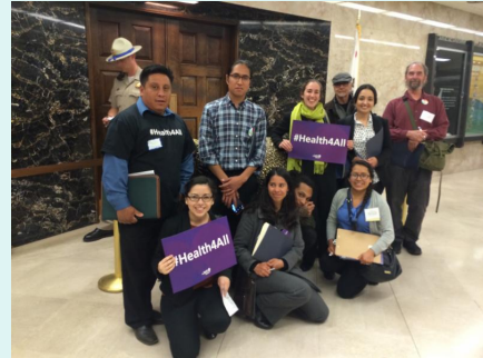
Pangea and VIDAS members advocating in Sacramento