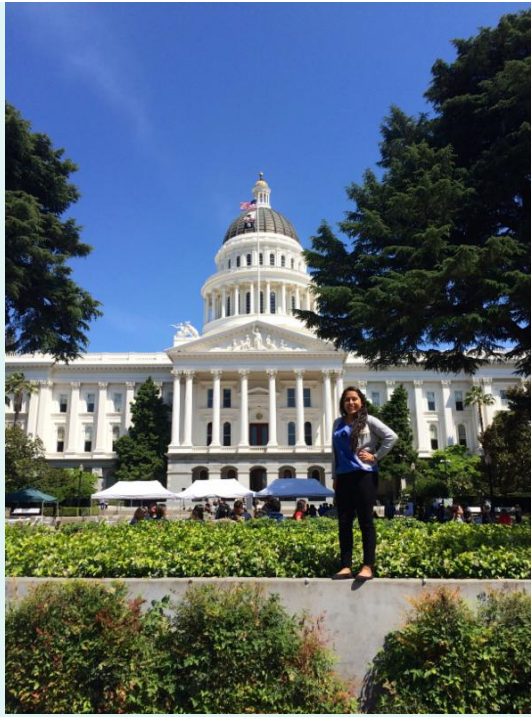
Pangea DreamSF Fellow in front of the State Capitol on Immigrant Day