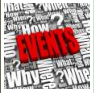
Looking for something to do? We have plenty of low OR no cost events on the calendar.