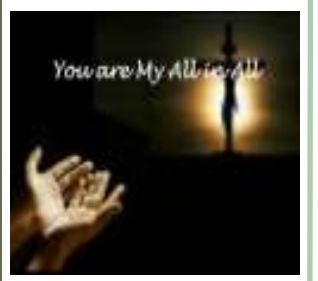
"The Source of all meaning carries, A Cross that opened the very door to Heaven! A Savior takes each one by the hand"

"Awareness is about us reprogramming ourselves to live in the moment and be mindful of what we are feeling, how we were feeling it, and where we are feeling it. "