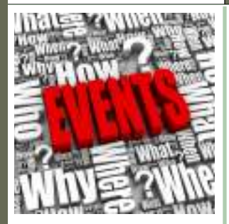
Looking for something to do? We have plenty of low OR no cost events on the calendar.