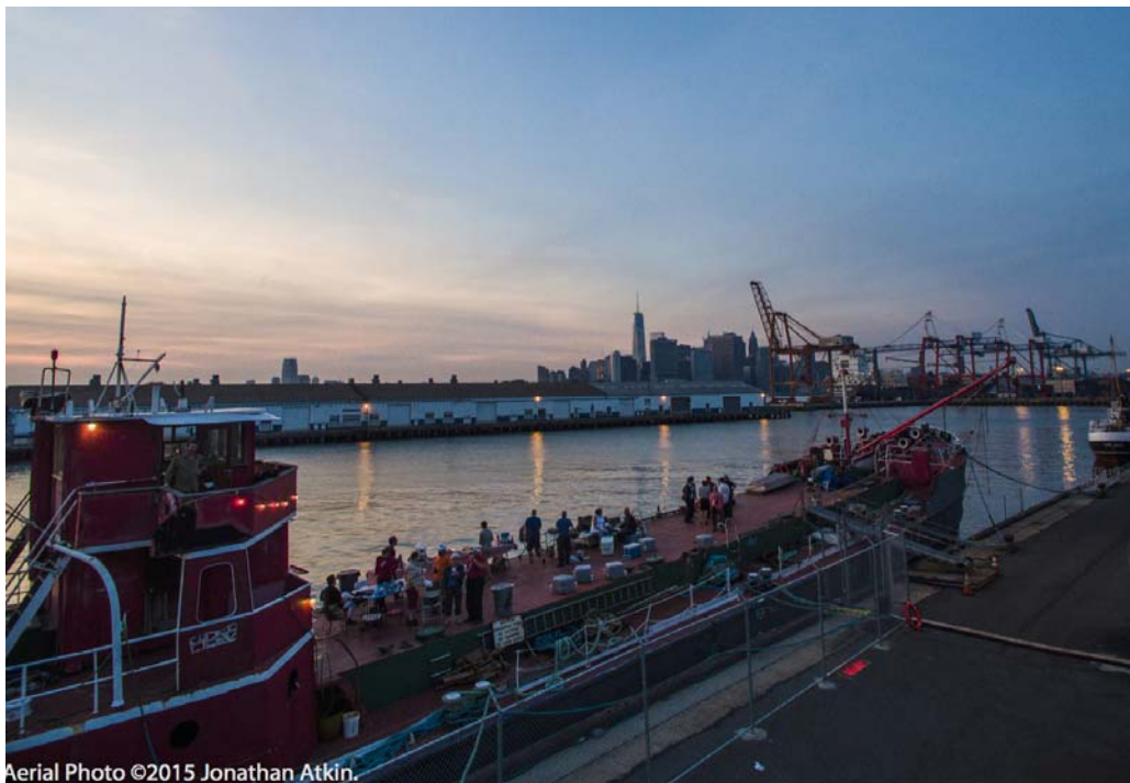
Aerial Photo ©2015 Jonathan Atkin.

Our location, in shot below, is here in Red Hook, Brooklyn, next to the Brooklyn Cruise Terminal and Pioneer Works. Ship can be moved for shoots.