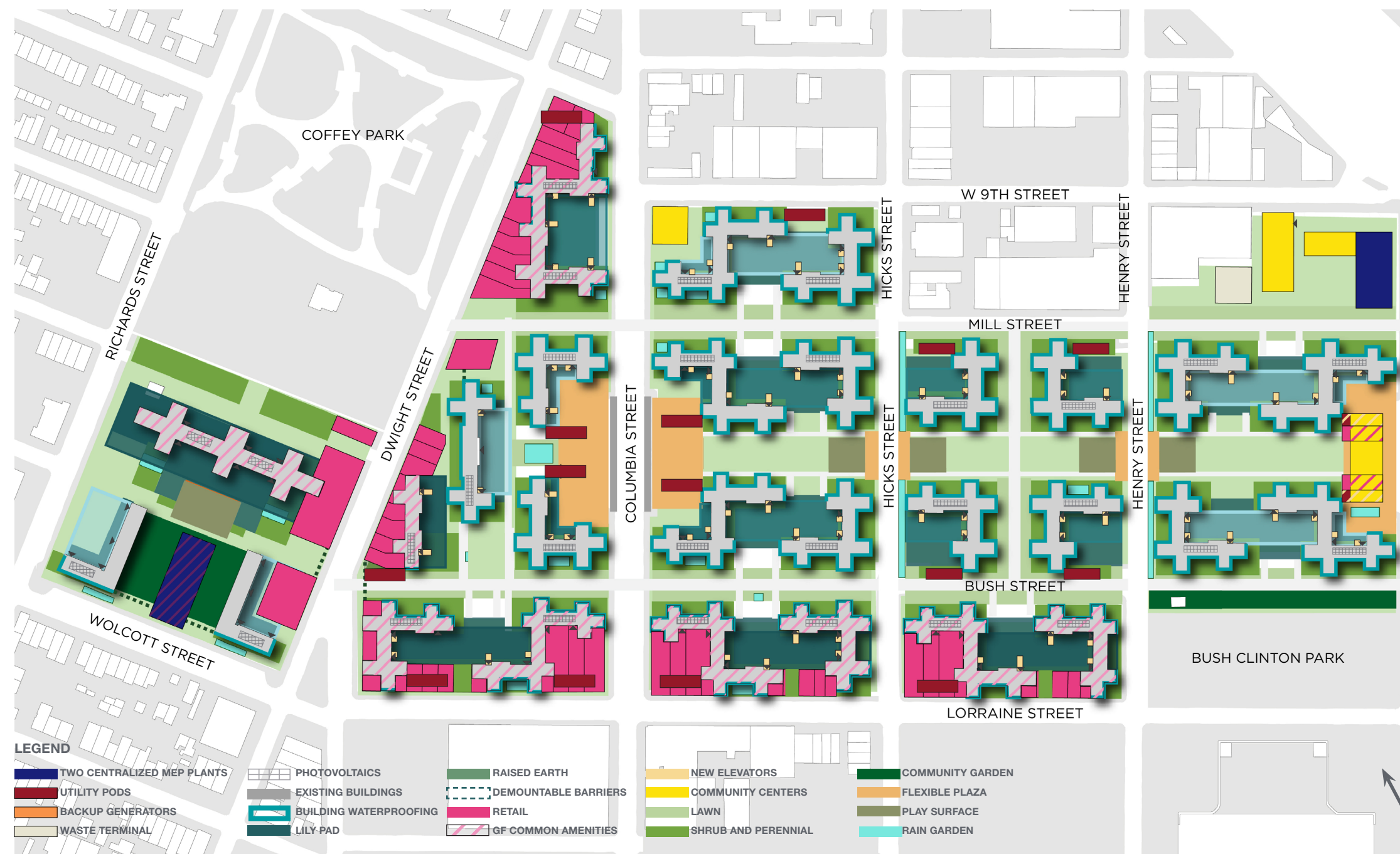
INDICATIVE SITE PLAN