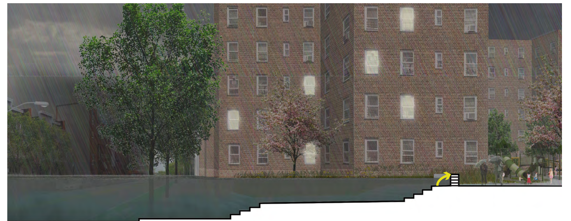
"LILY PAD" FLOOD PROTECTION TERRACING