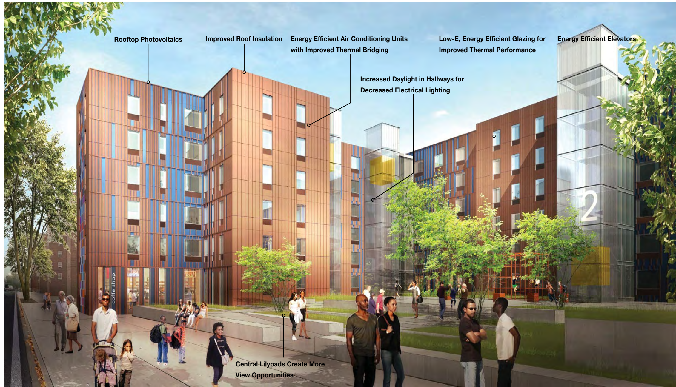
SUSTAINABLE BUILDING FACADE AND ELEVATORS