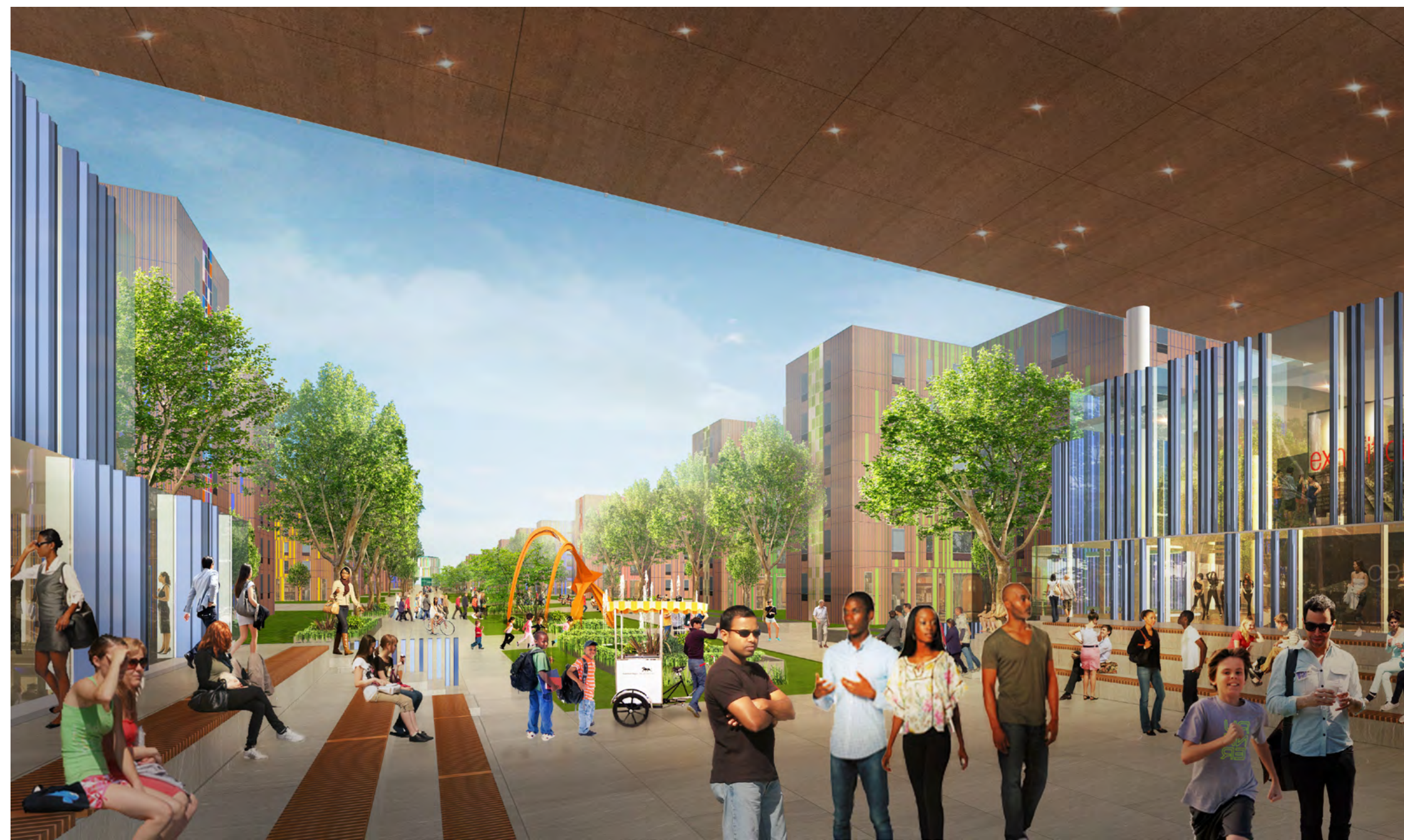
INDICATIVE PROGRAMMING ON THE CENTRE MALL