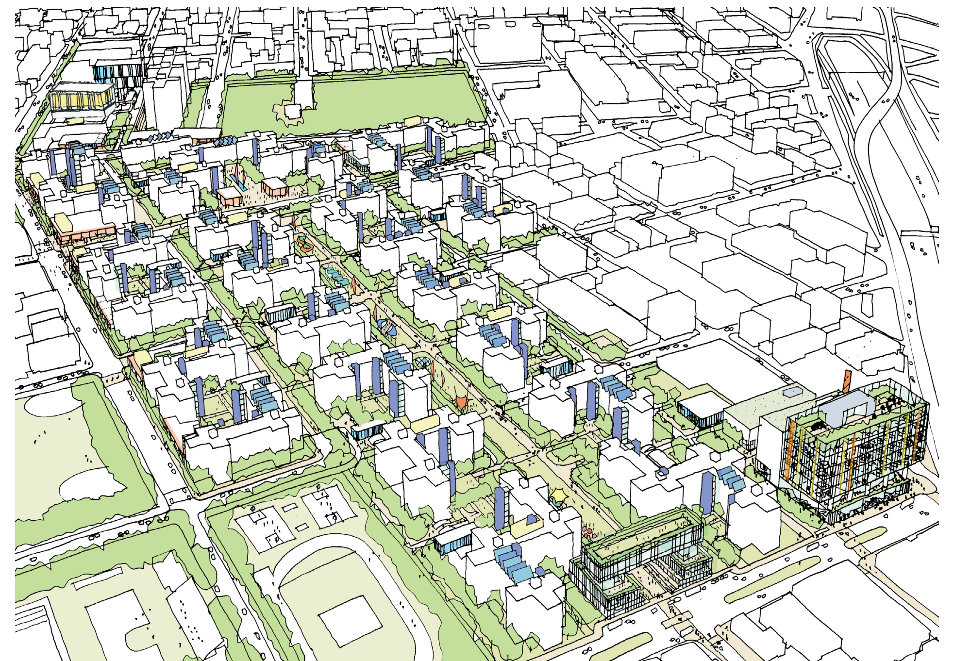
AERIAL RENDERING FROM EAST