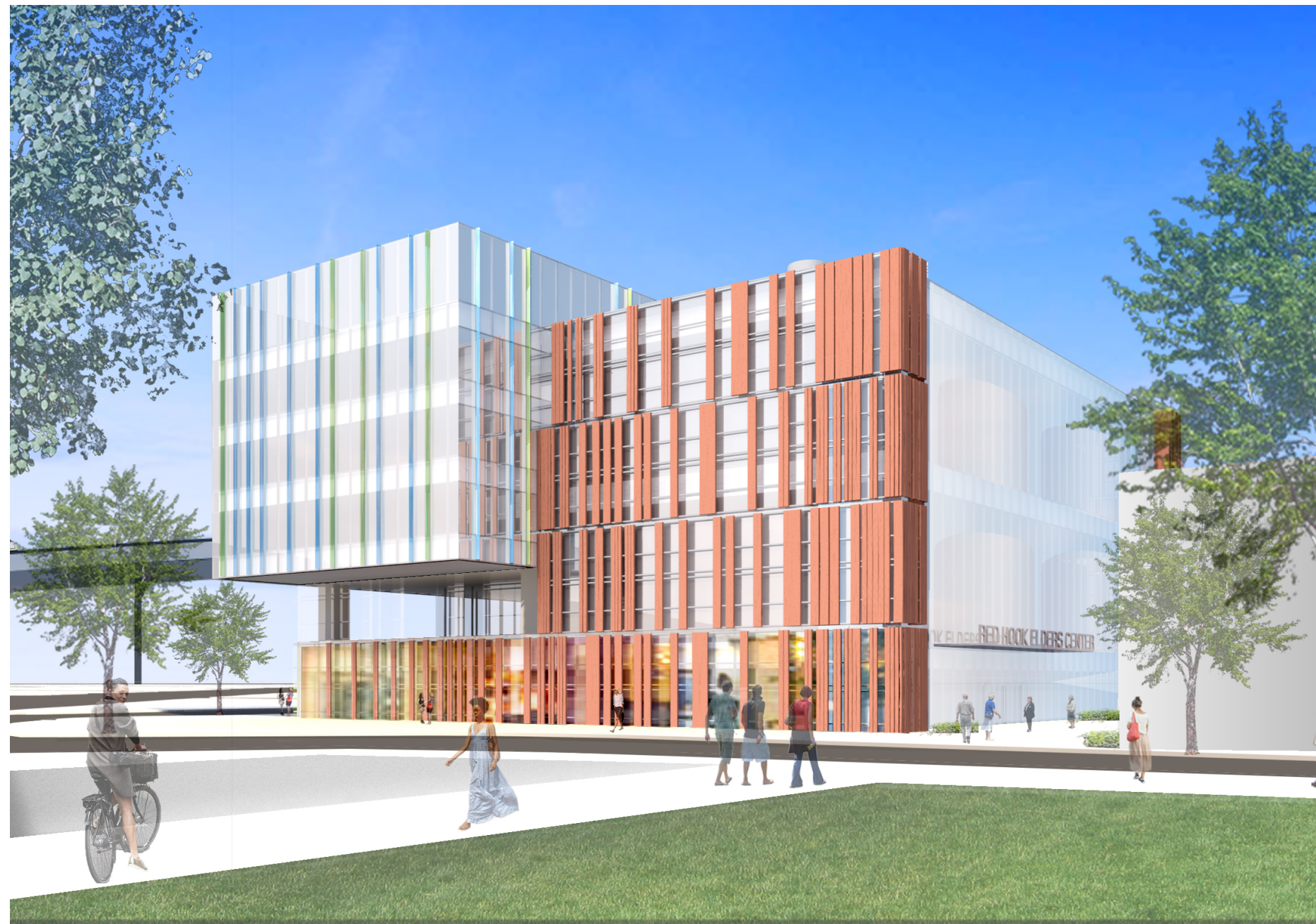
DISTRICT MEP PLANT WITH ADDITIONAL COMMUNITY PROGRAMS