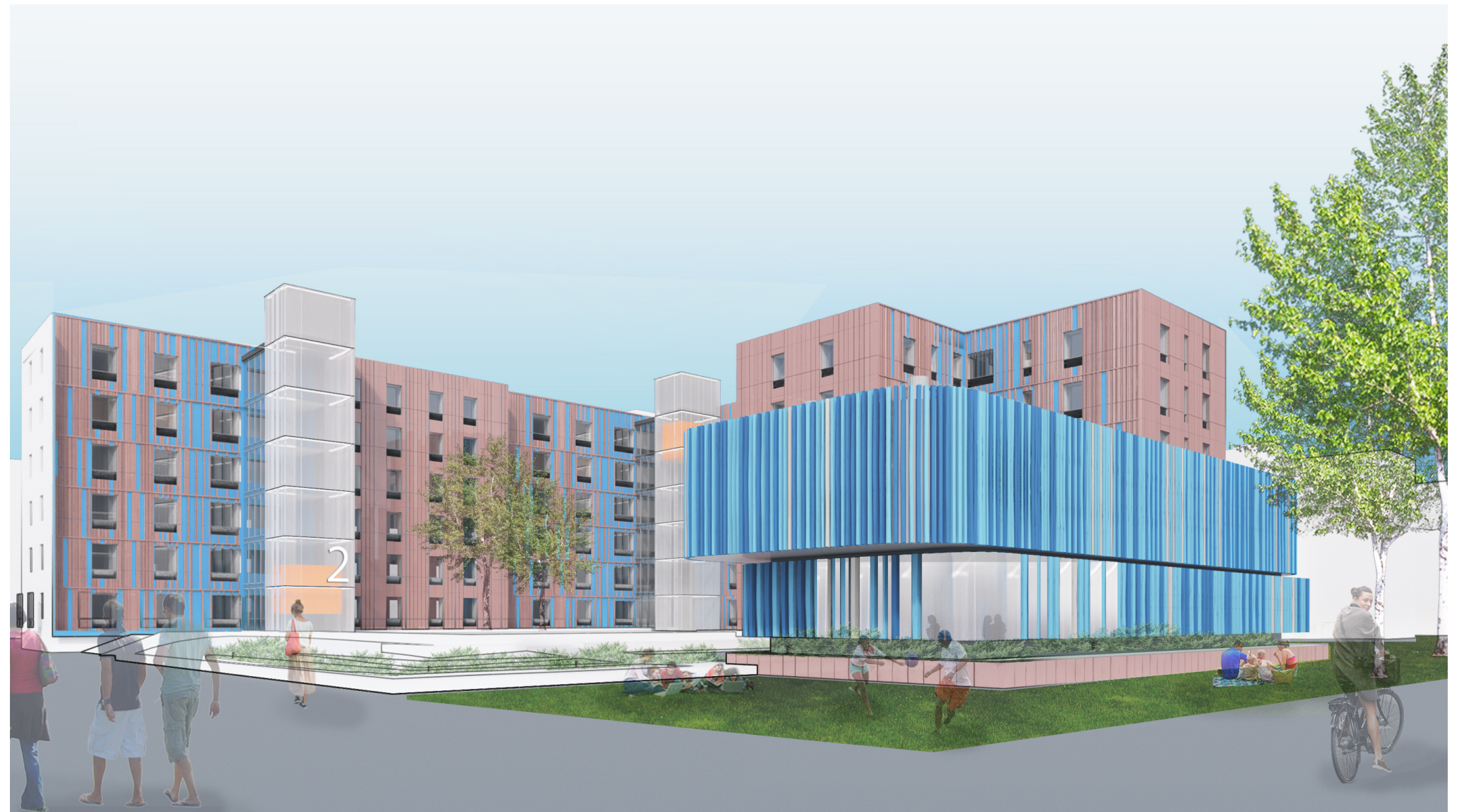
INDICATIVE UTILITY POD AND BUILDING OVERCLAD