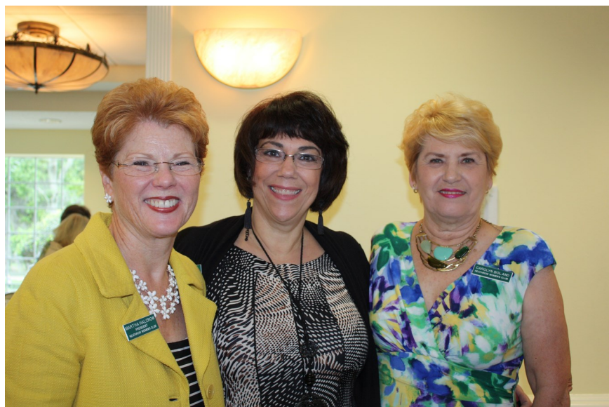
Enjoying the Rich Hippie Fashion Show!