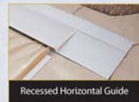
Recessed Horizontal Guide