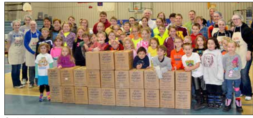
St. James, Northrop, students packed 23 boxes.

For more pictures and details, go to www.martinlutherhs.com/kidsagainst-hunger.html.