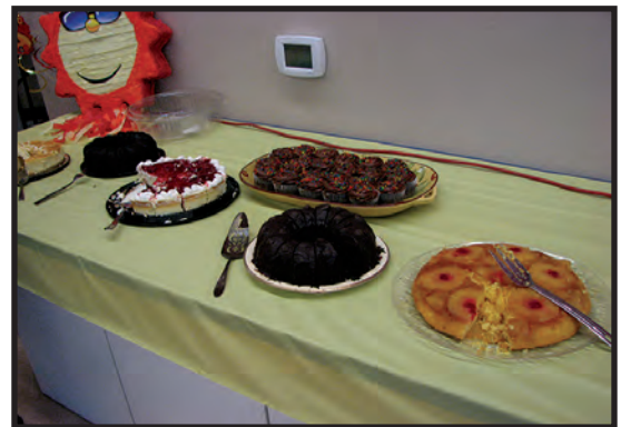
Marvelous looking desserts