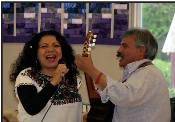
Outstanding entertainment by 'Duo Piel Canela'

Holiday of a three-night stay at the Sea Lion Surf Beach House, overlooking the ocean in Florence; Opera tickets for two at the Eugene Opera with dinner for two at the Oregon Electric Station to Up, Up In The Air, a 100-mile