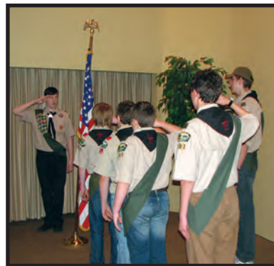
The scouts presented the Colors

the WWII Veterans Memorial for the first time.