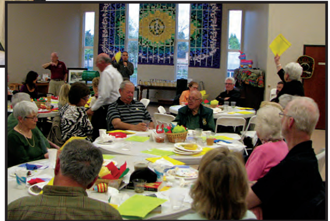
Club members (standing) reminded the attendees to hold up their bidder's number