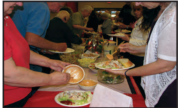
A great medley of food