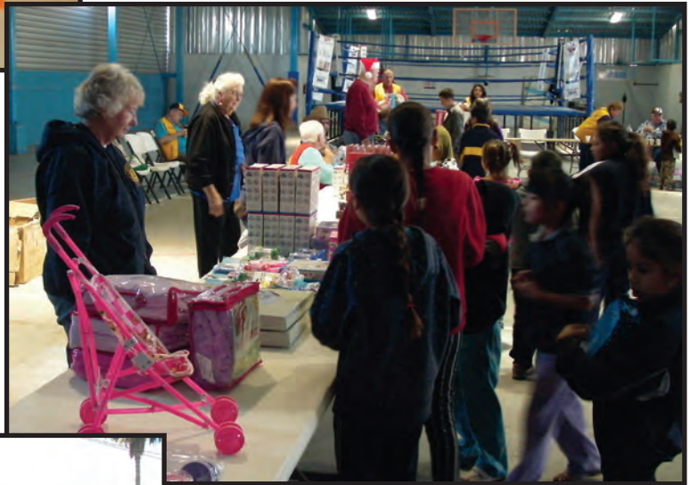
The children make their way past the gift table with lots more waiting outside

fundraisers they participate in at their home Club, much of which comes from an arrangement they have with Casinos in Canada. The Canadian Club has been averaging a donation of $5,000 and this year it was $6,000. The project takes place in mid-December and this year presented nearly 360 kids with gifts of