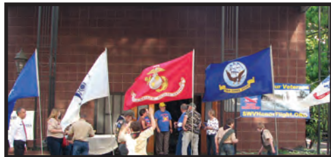
Veterans flags welcomed the movie goers

Friday, May 8th, South Willamette Valley Honor Flight and the Eugene Downtown Lions Club hosted the showing of an amazing documentary called "Forgotten Heroes An Honor Flight Story." The documentary tells the heartwarming story of one of many groups of WWII veterans who are taken to Washington D.C. free of charge to see