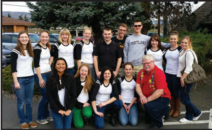
The Dalles Leo Club

(r) You can see the where the old trees were removed due to infestation. Ten (10) new trees were transplanted by our Leo Club during the Lion International Worldwide Service Week. The new trees were between 5 and 6 feet tall to help insure their survival.