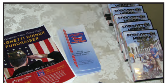
The movie on DVD