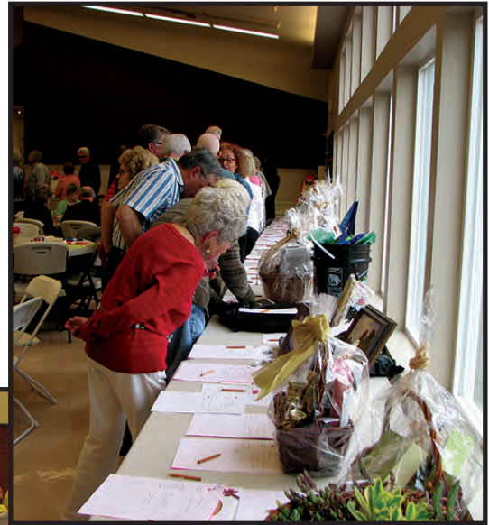
Attendees checked out the silent auction tables