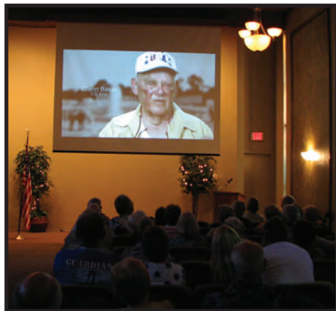
Watching the very emotional documentary