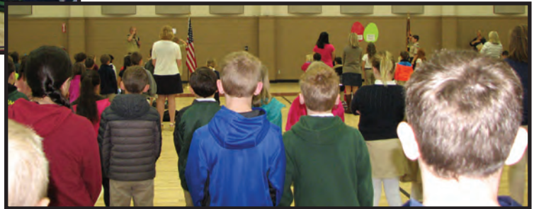
The Scouts performed the traditional "Presentation of the Colors"

the traditional flag ceremony and all recited the "Pledge of Allegiance" together. My part in the assembly was to explain the meaning of the words in the "Pledge of Allegiance." I really enjoy explaining the words of the pledge because, so often once it is memorized, people don't think of what the words mean as they are saying them. All 525 students received a flag, a block of wood with the Lions logo on it for a flag stand and