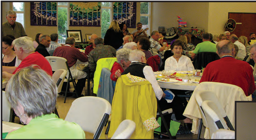
Comraderie was a large part of the event