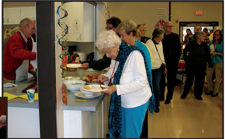
Standing in line for crab from the kitchen