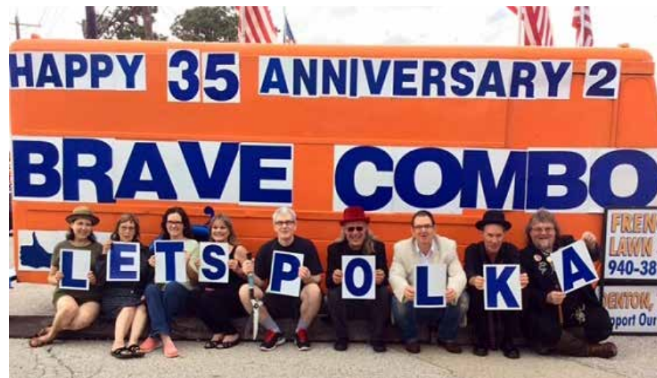
Brave Combo celebrated 35 years last year. Westfest was one of their first gigs.