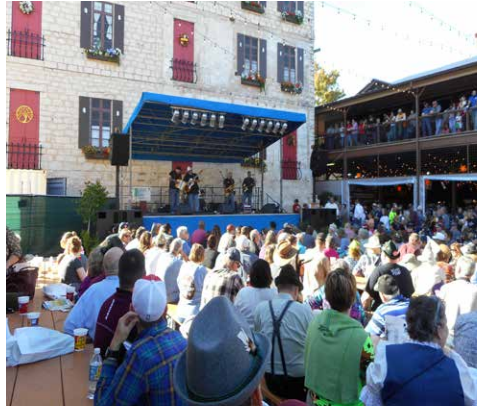
Wurstfest music lovers at the new stage in Stelzenplatz.

along the Comal River just below the Stelzenhaus Hall, which brought more food, beers, shopping, music and room to roam.