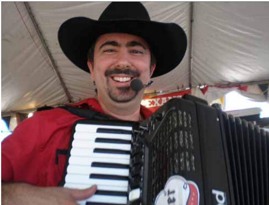
The Chris Rybak Party Stage is always a popular hangout at the fest.