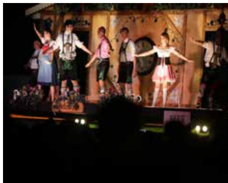
The Glockenspiel clock comes alive in Cleveland.

festivals throughout the USA. Some of the highlights include Labor Day weekend in Cleveland, Ohio ( clevelandoktoberfest.com ). With at least three stages of entertainment on the Cuyahoga County Fairgrounds, there is a great lineup of German, polka and rock bands in addition to numerous folk dance ensembles, including the champion German schuplattler verein Stv Bavaria. Stv Bavaria also presents the Glockenspiel shows each hour that are a highlight of the festival.