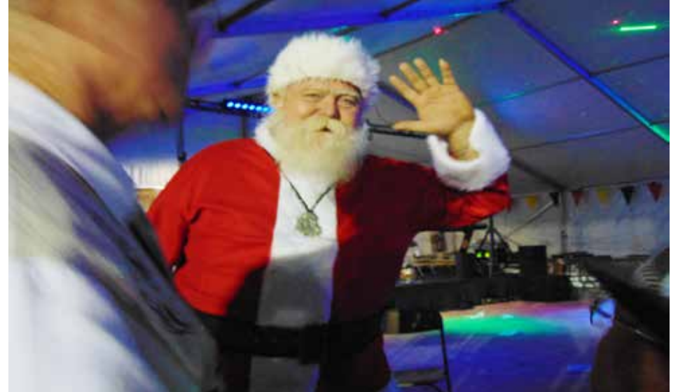
Santa says Merry Christmas y'all. Enjoy the holiday shopping at the fest, like the doll collection shown in photo at left.

An estimated 175 unique and interesting street vendors will line Market and S. Walnut Streets, selling German Christmas items, arts and crafts, and much more. Visit the "Weihnachtshaus" inside the