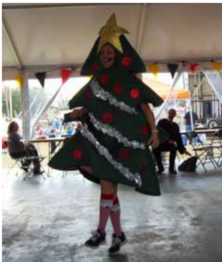
Valina, the dancing Christmas tree.