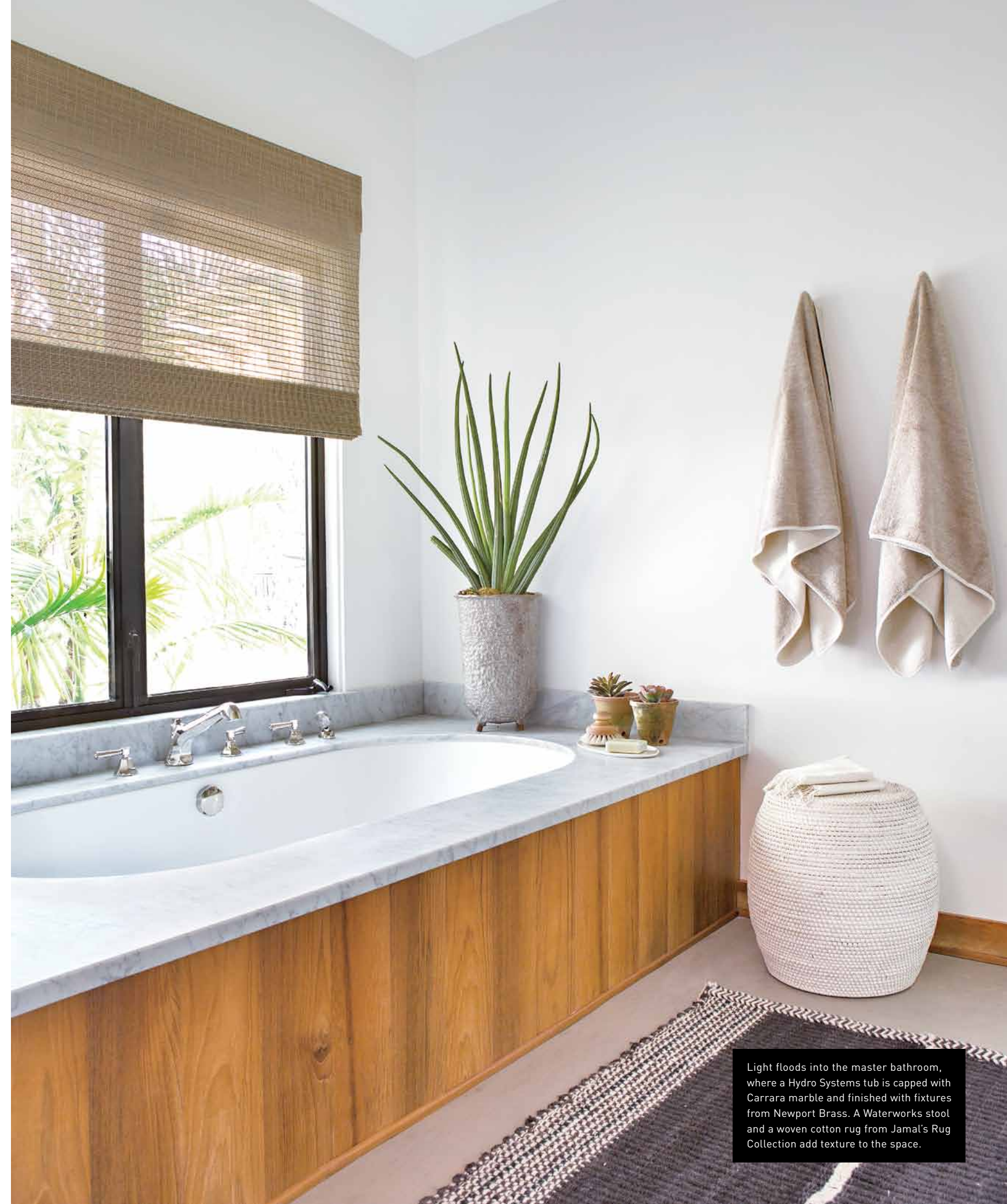
Light floods into the master bathroom, where a Hydro Systems tub is capped with Carrara marble and finished with fixtures from Newport Brass. A Waterworks stool and a woven cotton rug from Jamal's Rug Collection add texture to the space.