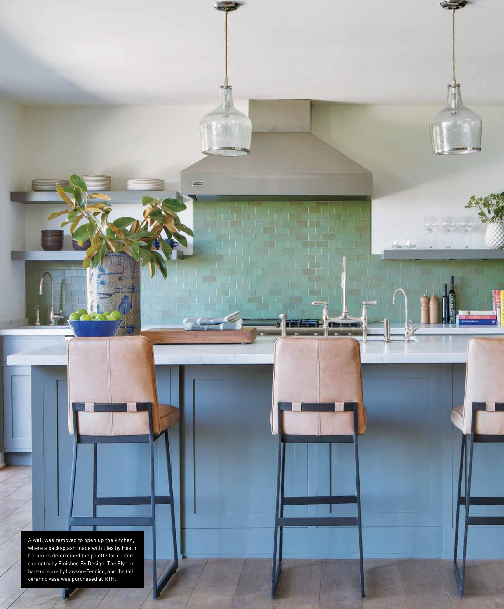
A wall was removed to open up the kitchen, where a backsplash made with tiles by Heath Ceramics determined the palette for custom cabinetry by Finished By Design. The Elysian barstools are by Lawson-Fenning, and the tall ceramic vase was purchased at RTH.