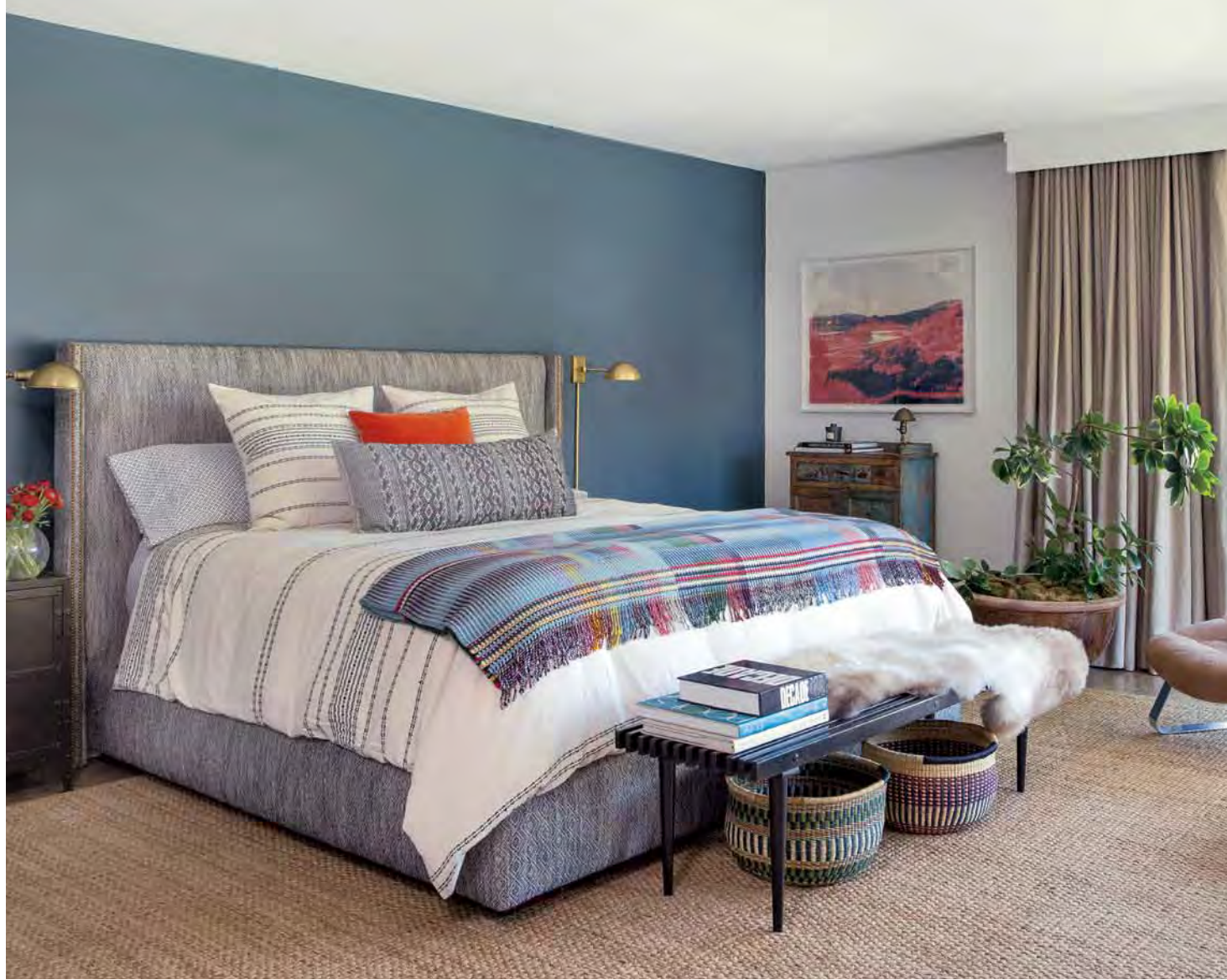
Above: Pratt & Lambert's New Moon blue lends a vibrant backdrop for the custom bed in the master bedroom. The Coyuchi duvet cover and shams are from NK Shop, as is the vintage Dutch chair. Right: Flowers perch on a side table from Restoration Hardware.