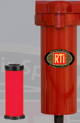
Coalescing Replacement Element