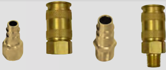
High Flow Plug & Couplers