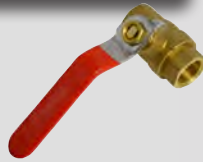
1/2" Heavy Duty Brass Ball Valve