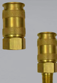
HIGH FLOW COUPLERS