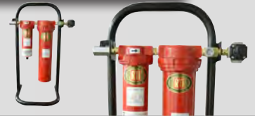
Demo Stand for E4000 Models (Stand only)