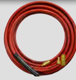
High Flow 35' & 50' Conductive Spraying Hose