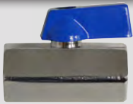
1/2" Chrome Ball Valve