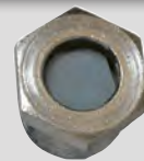
1/2" Sight Glass with Humidicator Paper