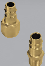
HIGH FLOW PLUGS