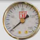
0-160 psig Gauge (For FR250-G/FR500-G)