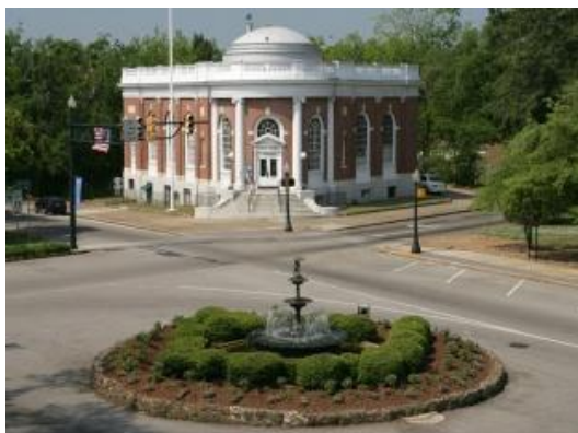
Aiken, South Carolina

There are a number of excellent restaurants within walking distance from each of the accommodation options we offer you. We can make restaurant bookings for you and we ensure everyone has someone to dine with if they choose. To view a short video overview of Aiken go to http://youtu.be/z8ui0-7OxDg