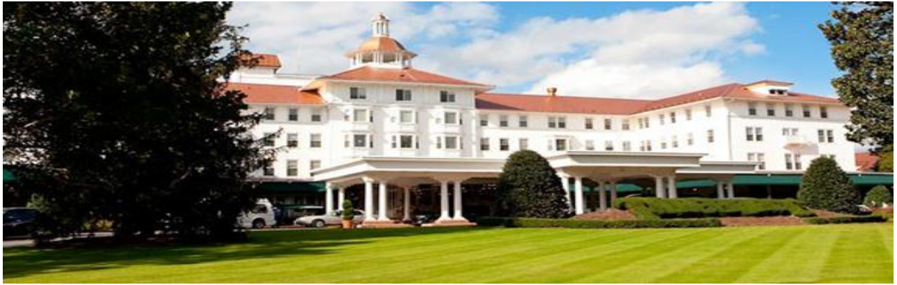
The Carolina Hotel, Pinehurst Resort