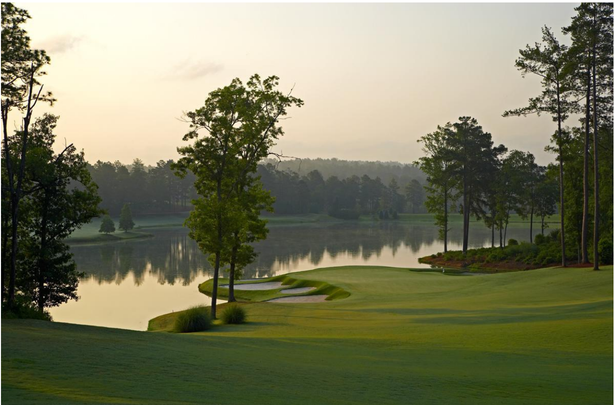
3rd Hole at The Reserve Golf Club