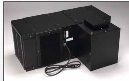
System shown with optional integrated humidifier