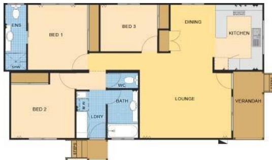
Sample floor plan of a Wavecrest Village home.

All homes have telephone, broadband internet and pay TV access (Foxtel)