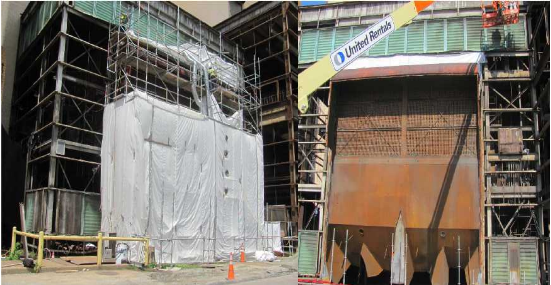
ACM removal operation on the Precipitator Unit. Map location key (1)