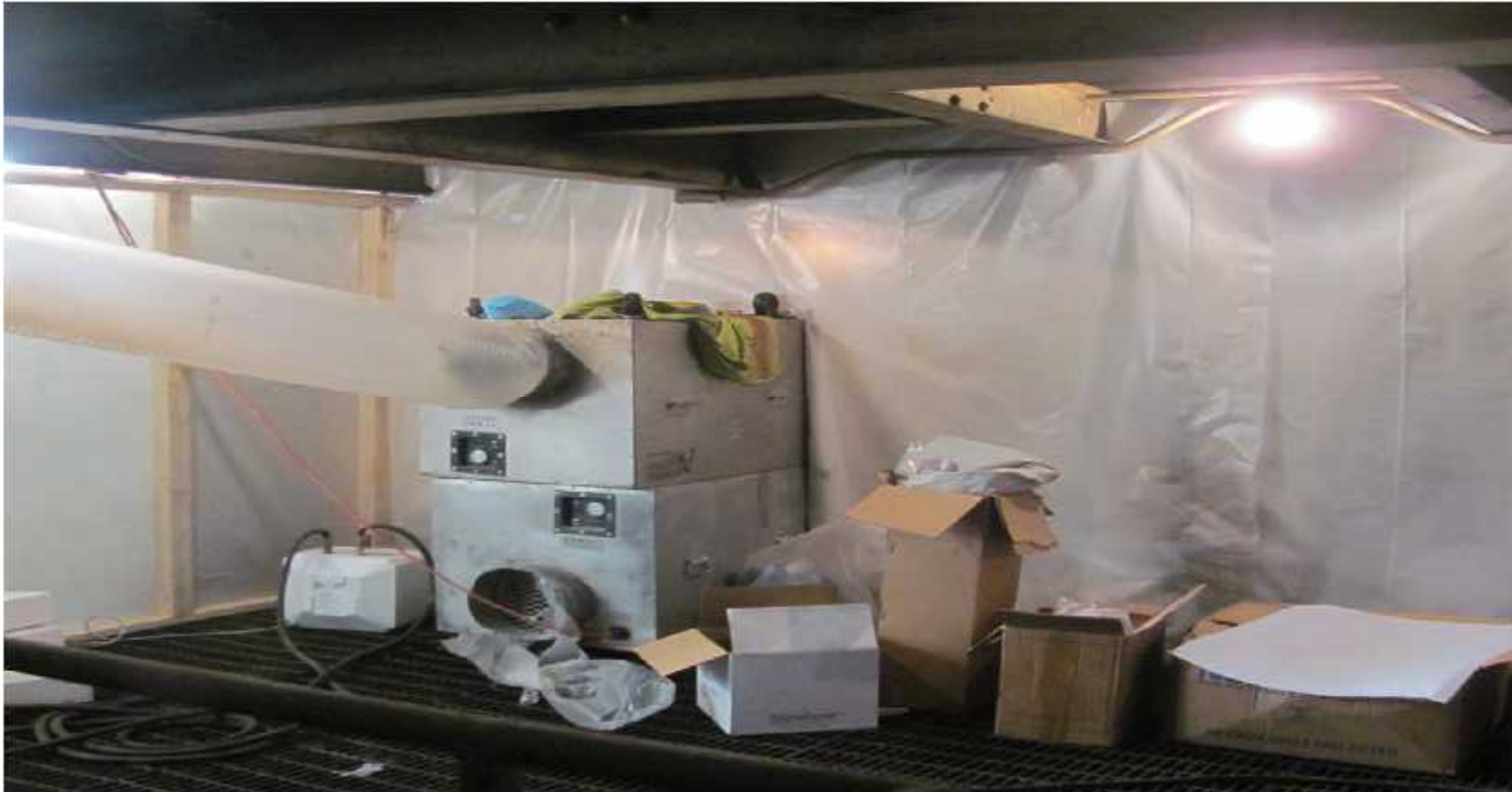
Power Plant Boiler No. 13 south-side view of Asbestos containment area. Map location key (1)