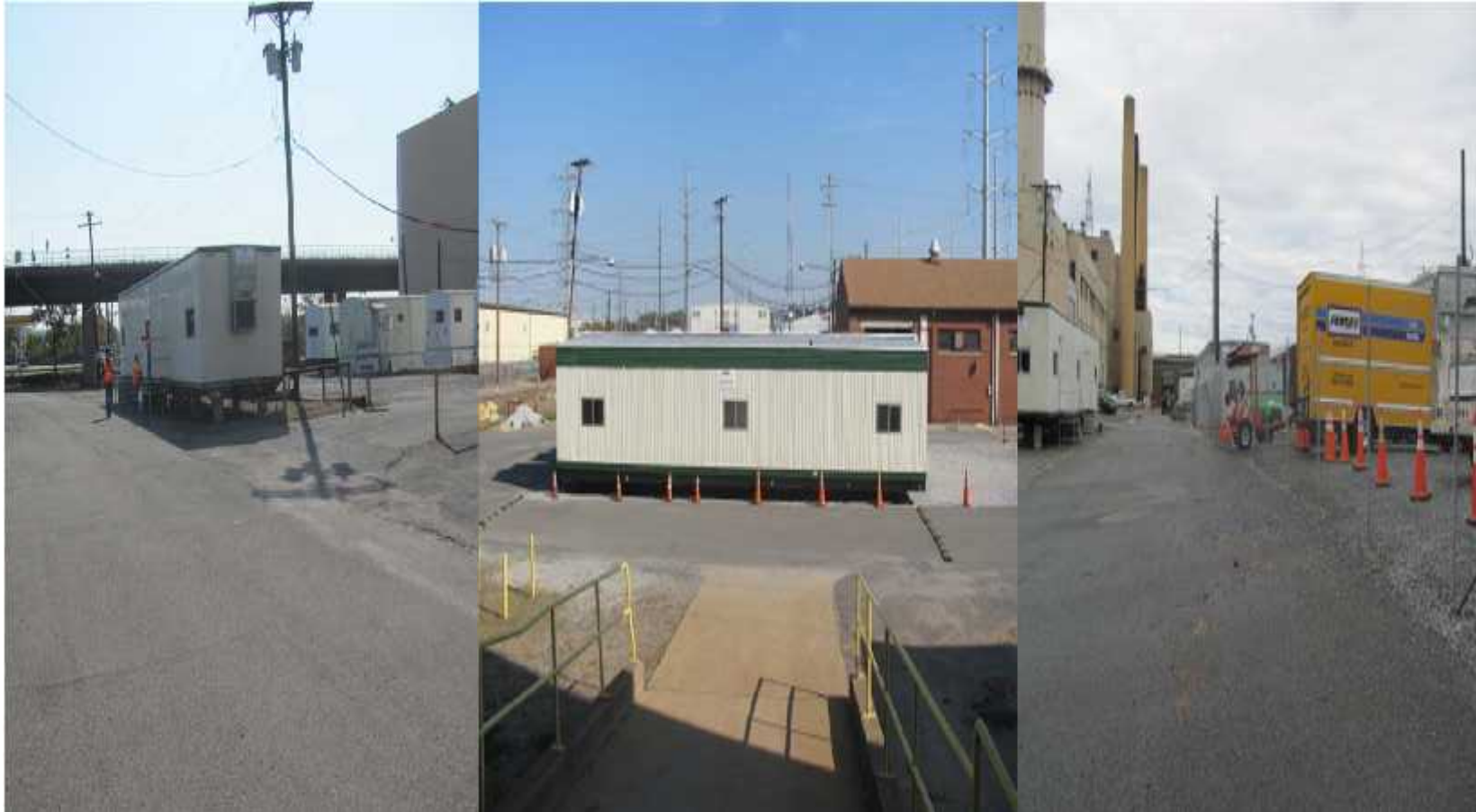
Contractors site & Owners Operations offices. Map location key (1)