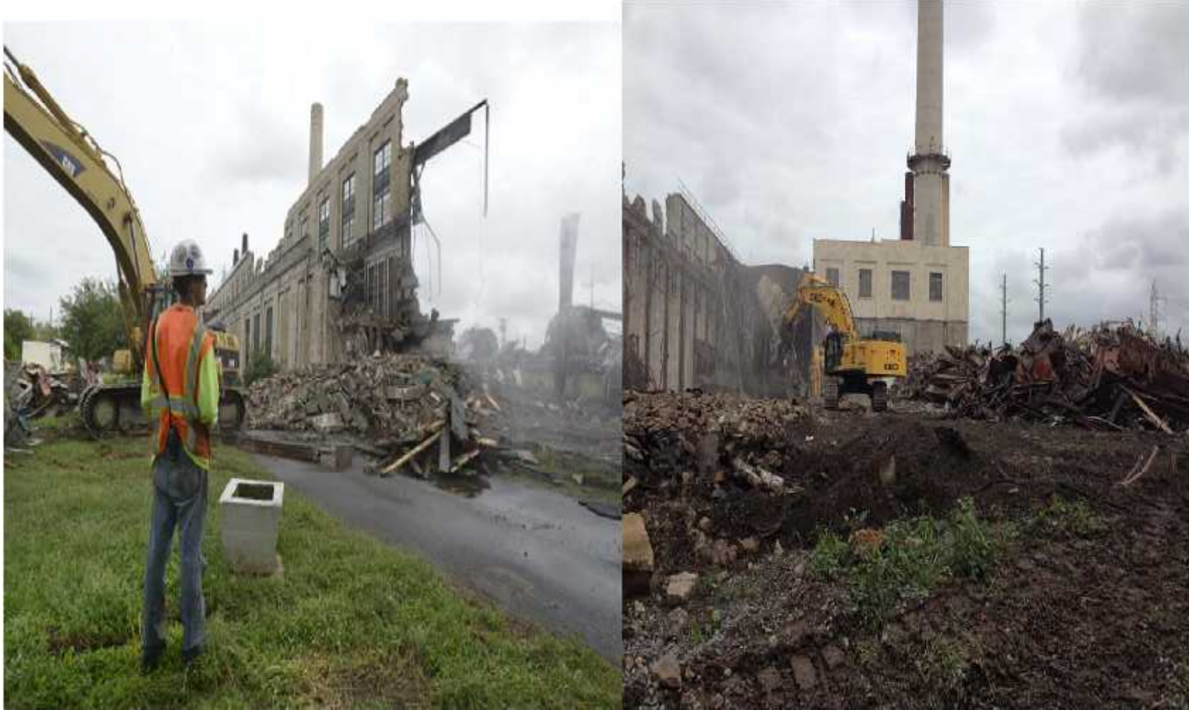
South View of Old Turbine Hall area. Map Location key (1)