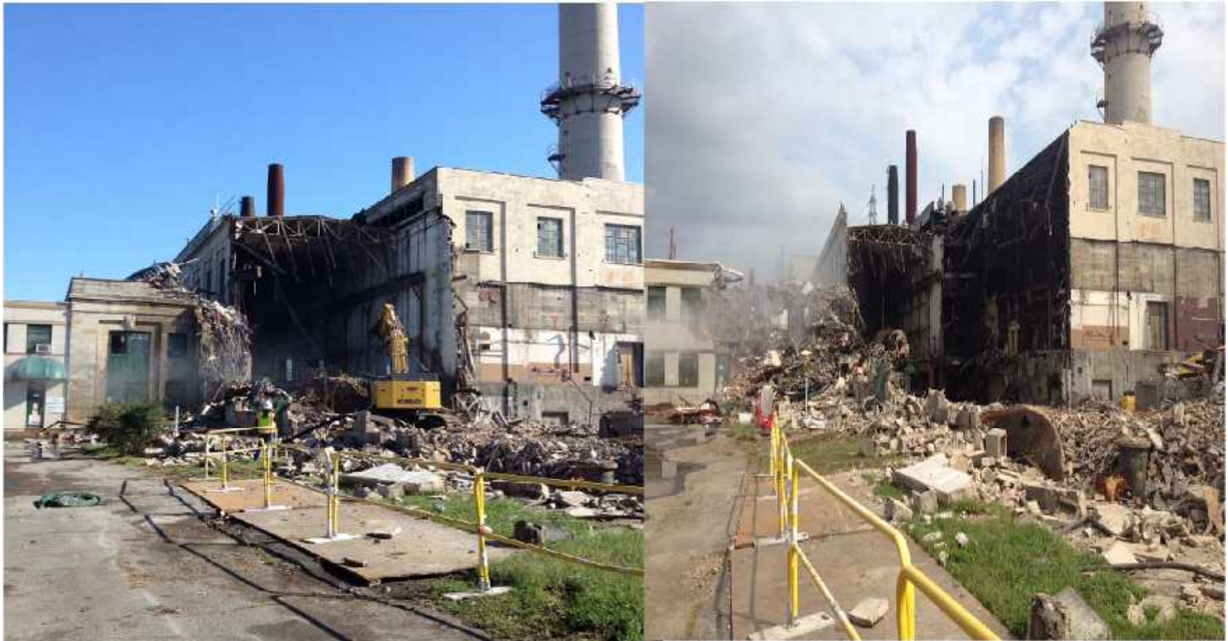
View of the Old Turbine hall, Administration Building and Auxiliary Boiler Building. Location key (1)