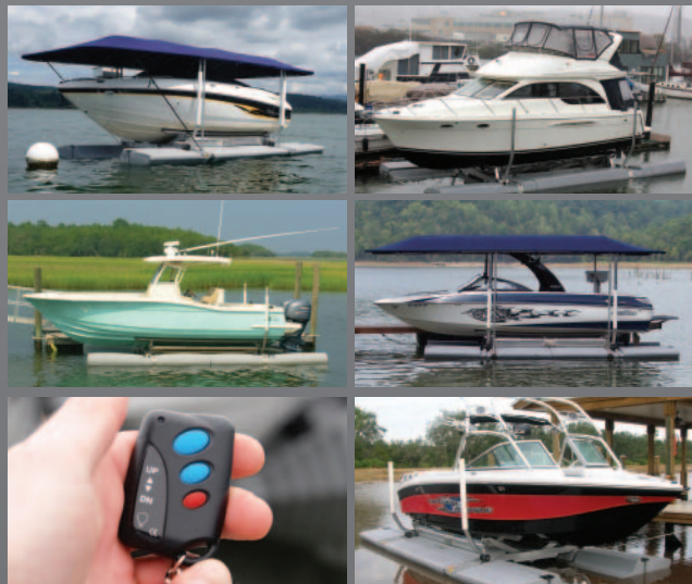
Remote control standard with all FloatLift™ models.