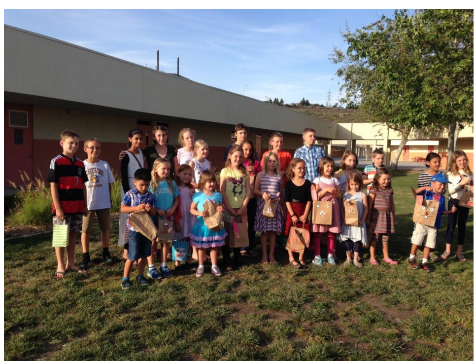
The Great Easter Egg Hunt 2015

More than 200 eggs were hidden by teachers and parents and all but one were found.