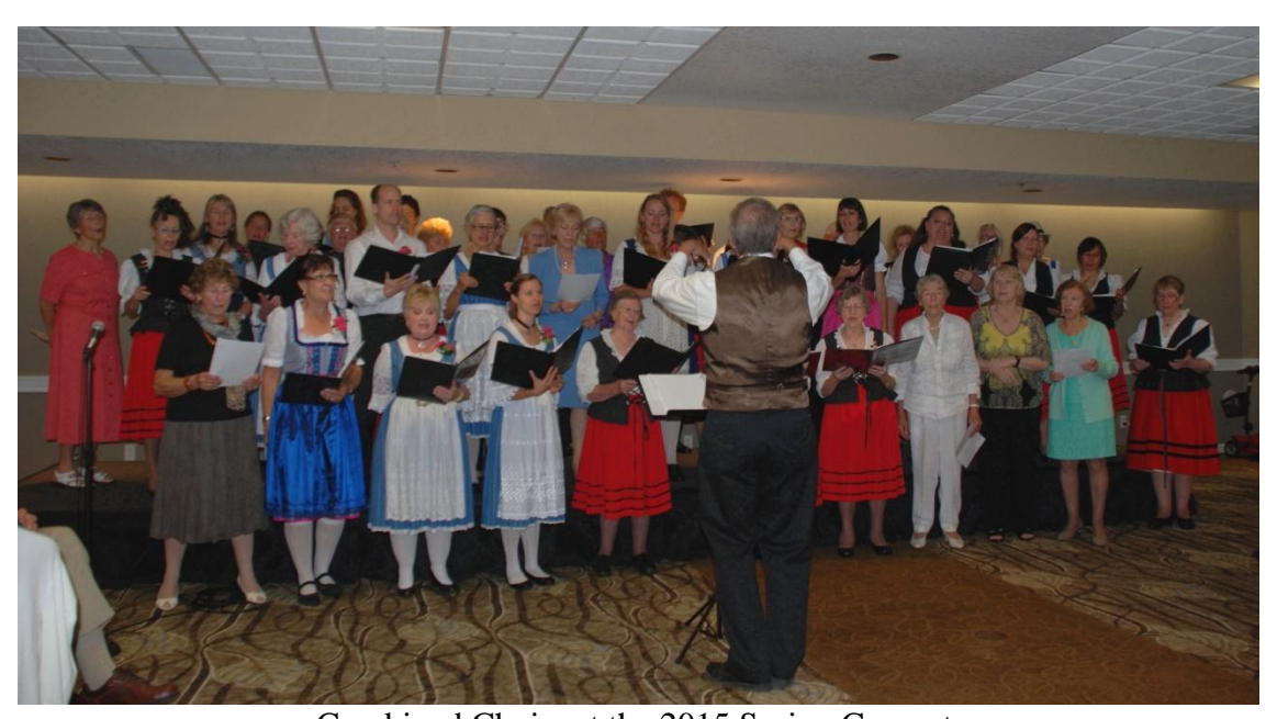
Combined Choirs at the 2015 Spring Concert