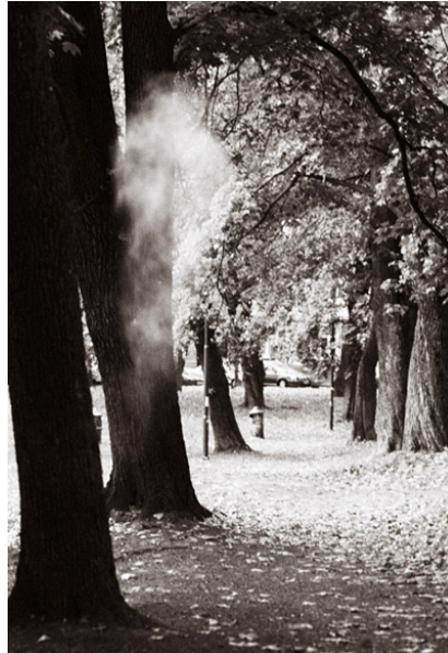
Thale Fastvold Genius Loci 2012 Giclee print 24x17"

Fastvold's photographs from her series Genius Loci borrow from the aesthetics and traditions of ghost photography. In early photography, all photographs were considered to be true representations of reality. Odd lighting effects or inconsistencies in the photographic negative were sometimes thought to be ghosts. Genius Loci translates from Latin as "spirit of the place." All cultures have certain places that are considered to contain spirits. Often times these places are the sites of monuments. In her