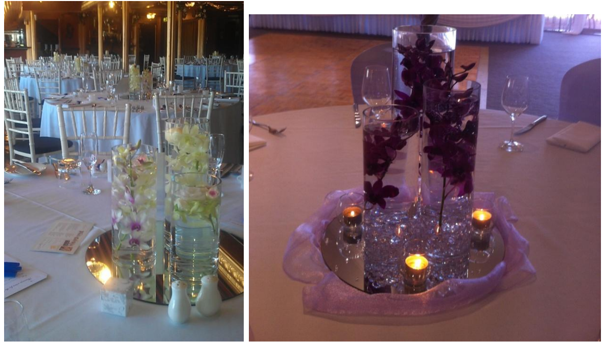
3 different height vases, with single orchid in each and a floating candle in one / 3 tealight candles to surround, on a mirror base.