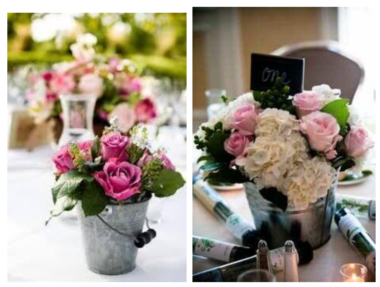
Your choice of either 1 X 10cm tin pail with spray roses, foliage and flowers in season or 3 mini tin pails. Tin pails can be in silver, white, blue, lilac, pink etc. Max of 2 different colour flowers.

3 mini fishbowls with a cymbidium orchid head in each (must all be same colour) DESIGN O