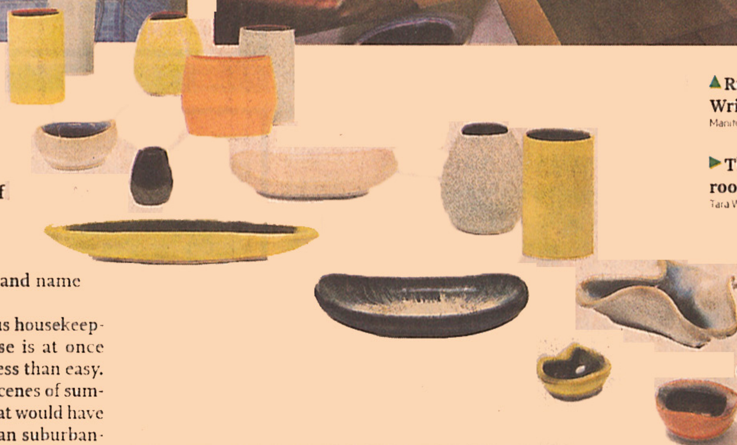
▶ Collection of 15 vessels Wright, Chicago

just as they knew the brand name Betty Crocker.