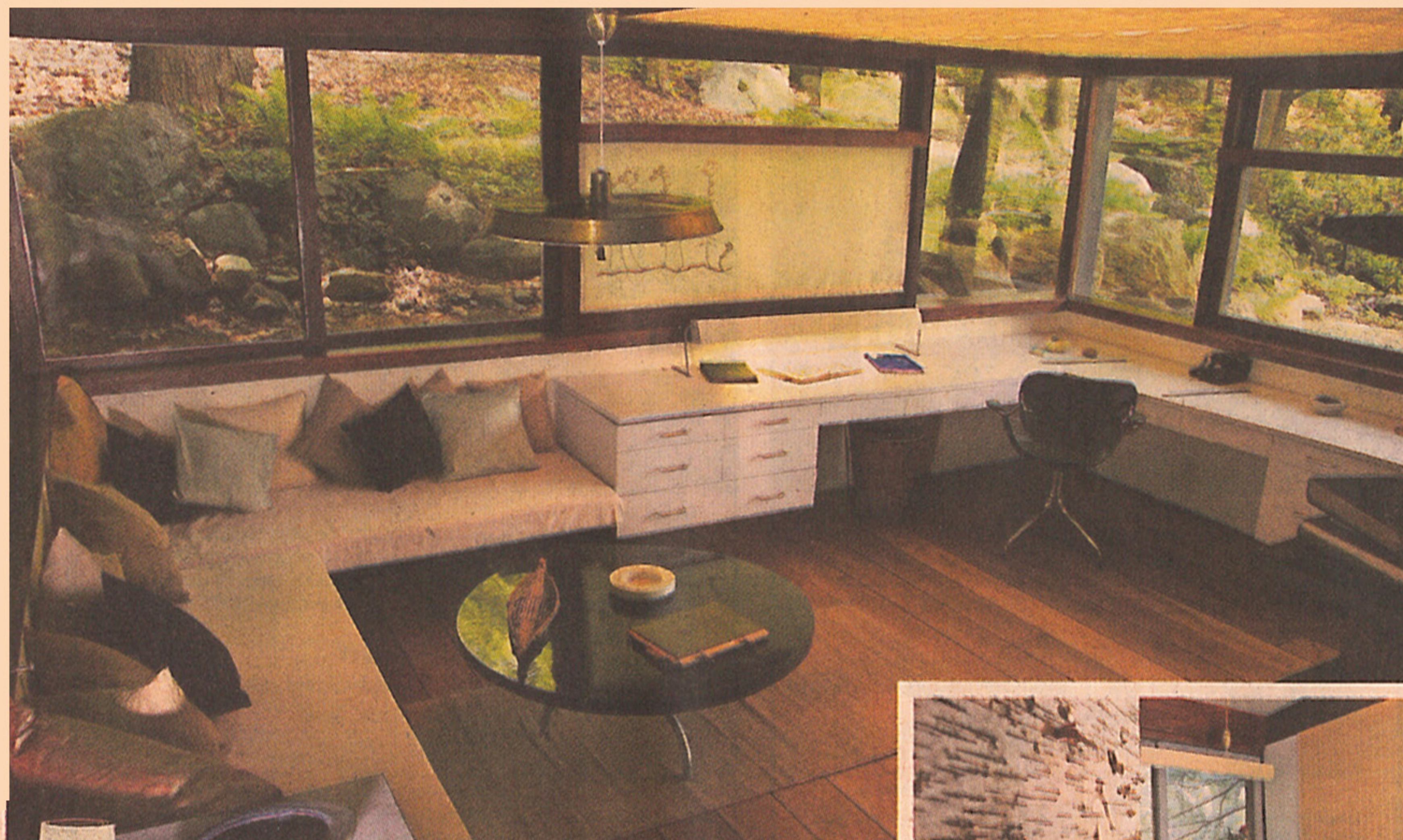
▲ Russel Wright's studio Manitoga Archives