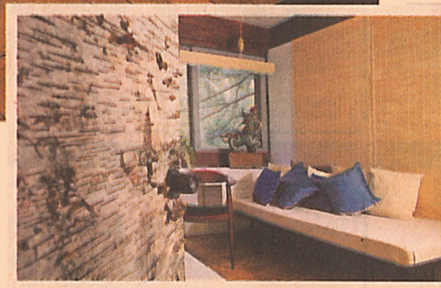
▶ The guest room Tara Wing