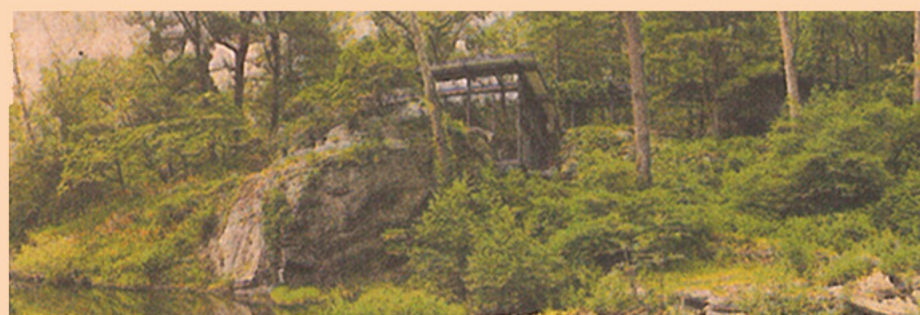
▲ Panoramas of the site, in the 1950s, and in 2012

House or Frank Lloyd Wright's Fallingwater are. The designer knew most of his well-heeled guests, not to mention middle-class homeowners of the time, would not want to live with birch bark-veneered doors or a rough-hewn granite staircase. Instead, he wished it to be an inspiration, showing an easier, more carefree life than Americans had ever known.