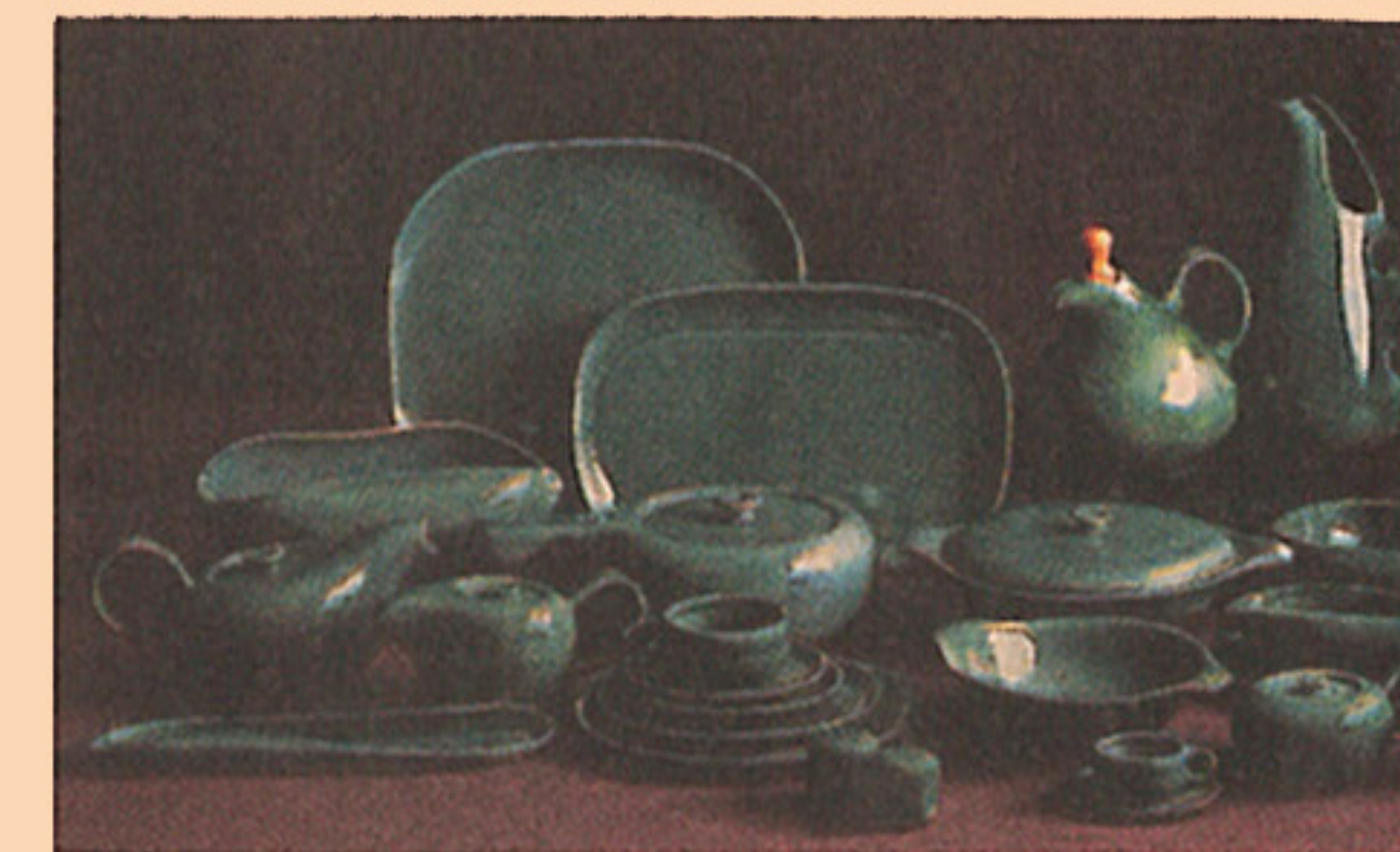
▲ American Modern tableware — Masca

ble, through large windows and tree trunks stripped of bark and brought indoors as support columns. White pine needles are pressed into the green plaster of the studio ceiling to echo trees overhead, and hemlock needles embedded into a wall create a continuous surface of botanic texture as the eye passes from indoors to out. Some of the more experimental surfaces deteriorated even before Wright's death in 1976, but he is said to have enjoyed these failures as much as the successes.