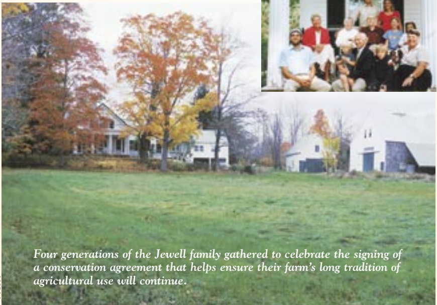
Four generations of the Jewell family gathered to celebrate the signing of a conservation agreement that helps ensure their farm's long tradition of agricultural use will continue.