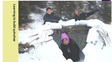
Learning to build quinzhee