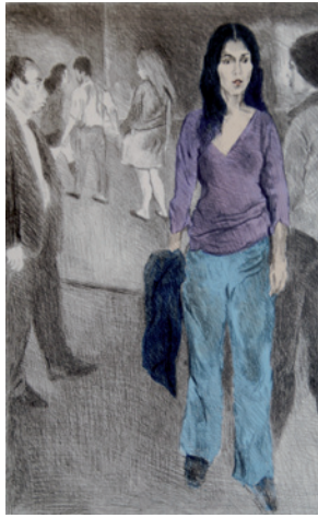
27. Raphael Soyer (1899-1987) Girl in Purple Shirt and Blue Jeans c. 1980 Color lithograph 19 7/8 x 15 1/8 inches c. 1980, edition of 300, signed in pencil lower right <293/300> $1,000