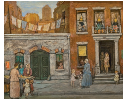
12. Jerome Myers (1867-1940) The Lower East Side 1938 Oil on canvas 25 x 30 inches Signed and dated lower right $75,000