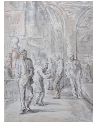
2. Reginald Marsh (1898-1954) Bowery Scene "Strokey's" 1944 Watercolor and gray wash on paper 30 3/4 x 22 1/2 inches Signed and dated, lower right $150,000