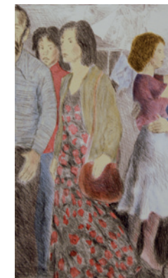
25. Raphael Soyer (1899-1987) Street Scene c. 1980 Color lithograph 18 7/8 x 16 5/8 inches c. 1980, edition unknown, signed in pencil lower right, <AP> $1,200