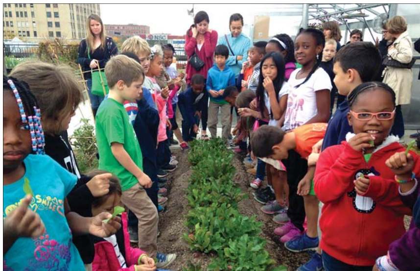
Mallinckrodt Academy Field Trip

Urban Harvest STL is a 501(c)3 nonprofit organization. Please consider making a tax-deductible donation and assist in our mission to empower communities to cultivate equitable access to healthy, sustainably grown food and enhance biodiversity in cities.