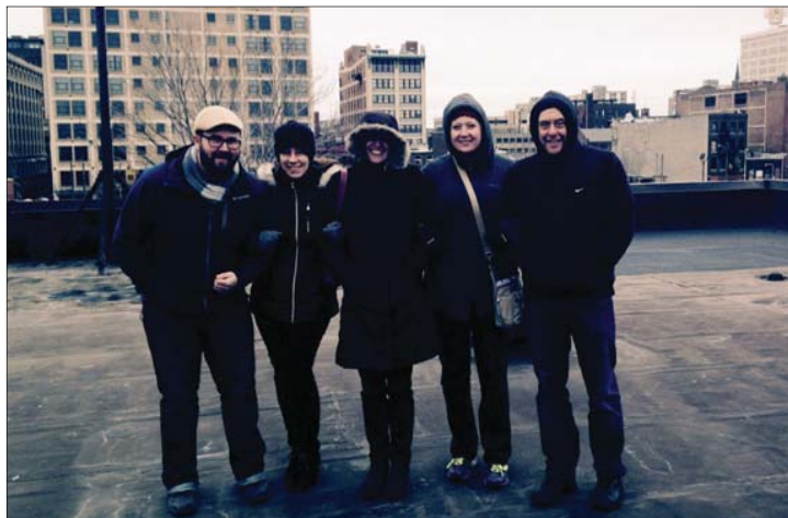
FOOD ROOF Farm prior to construction