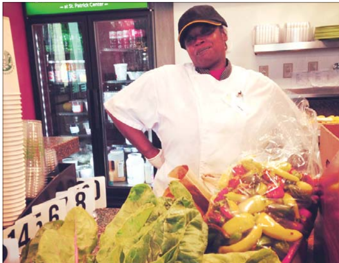
Weekly donations to St. Patrick Center

They say it takes a community to build a farm.... and now we know why! The support from the community has been incredibly humbling, and the media has also been very kind in helping to share our story. We made the NEW YORK TIMES and Huffington Post, and are proud recipients of the 2015 Innovators in Urban Agriculture Prize awarded by the International Network for Urban Agriculture!