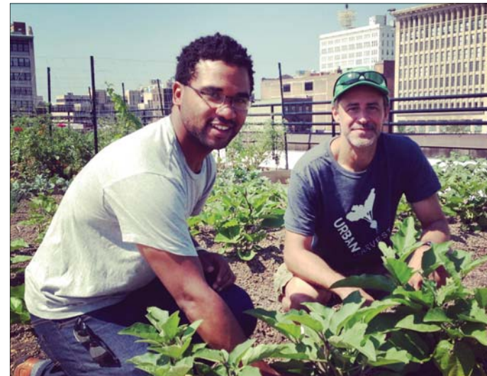
STL Metromarket Founder & Urban Harvest STL Co-Founder