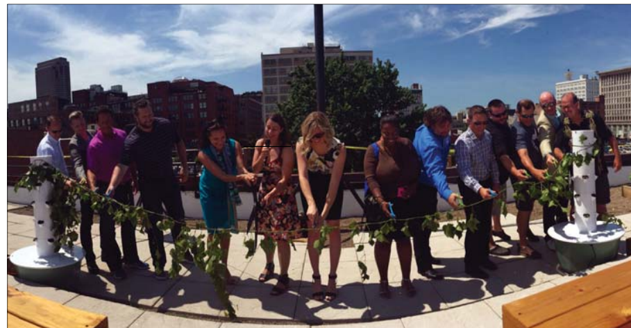
FOOD ROOF Farm ribbon cutting