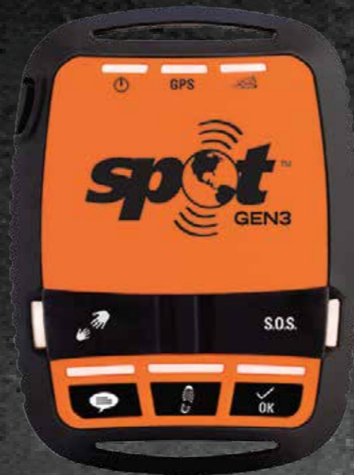
Pictured at actual size. 8.72 x 6.5cm.

SPOT GEN3 gives you a critical, life-saving line of communication when you travel beyond the boundaries of mobile coverage. SPOT GEN3 lets family and friends know you're OK, or if the worst should happen, sends emergency responders your GPS location - all with the push of a button. Add this rugged, pocket sized device to your essential gear and stay connected wherever you roam.