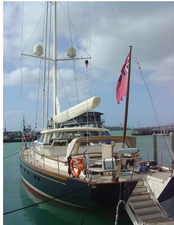
"Paradiso" constructed by Alloy Yachts International Ltd uses ARMATEC fibreglass engine exhaust tubing.

Typical tubing sizes include 50, 75, 100, 125, 150, 200, 250, 300 diameter and larger sizes. Reducers and spigots are available to fit standard flexible rubber hoses to couple to marine engines.