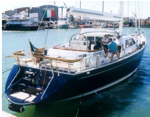
"Spirit of Fitzroy" has an FRP exhaust system by ARMATEC.