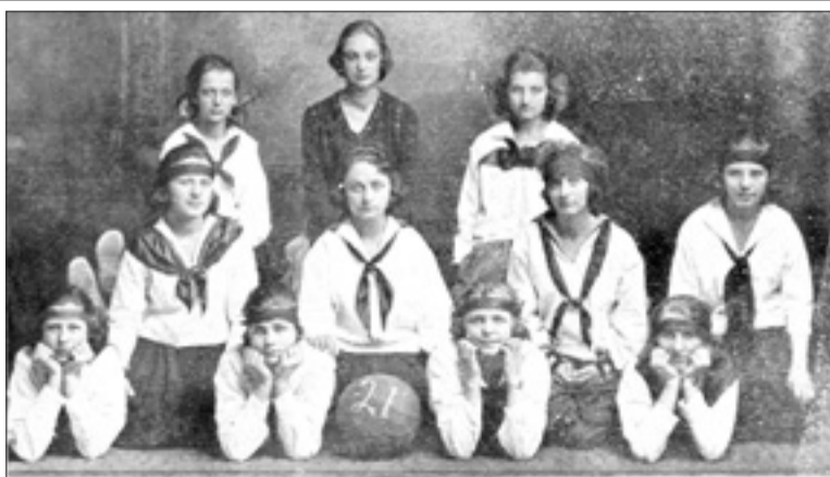
Elk Horn Girls' Basketball Team from 1921.