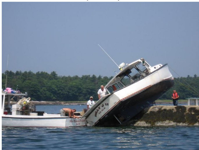
"Is it nothing to you, all you who sail by?" Lamentations, 1:12