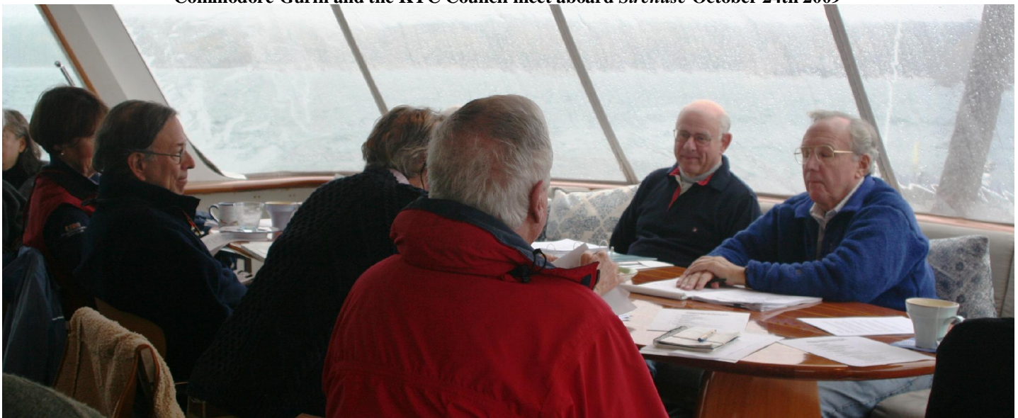
Afloat, but not adrift!