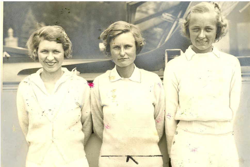
A quiz for all you Septua/Octo/Nanogenerians: Recognize anyone in this photo?