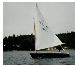
A gunter Riggerd Bruta Beast