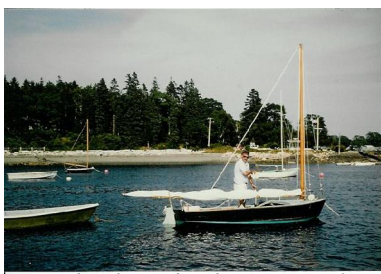
KYC student from other days in a Bruta Beast

For additional sailing education information as it develops do please check, or click, on the KSEA web site. TWL