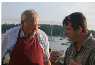
Father & Son Super-Chefs