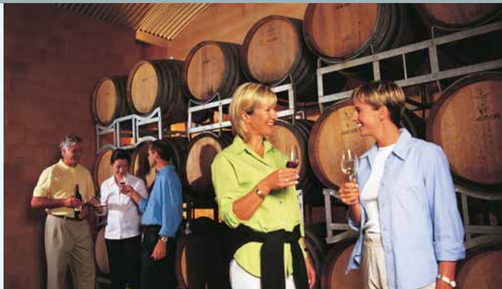
At Pipers Brook vineyard

The following day explore the east coast cellar doors of Freycinet and Spring Vale , or Apsley Gorge and Craigie Knowe (the latter two open by appointment).