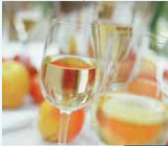
At Home Hill Winery