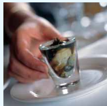
Tasmanian oyster shooter

A short drive farther on taste the freshest berries in season and a range of fruit liqueurs at the Sorell Fruit Farm .