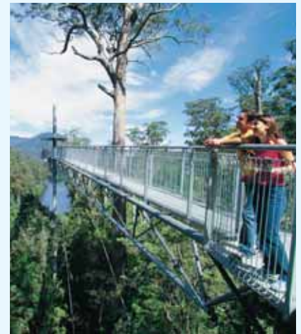
Tahune Forest AirWalk

Farther south are the outstanding forests around Geeveston. For a unique perspective on this timeless landscape, stroll through the canopy of a mature forest on the Tahune Forest AirWalk , 50 metres above the confluence of the Huon and Picton Rivers. On your way back to Hobart, visit Huon Valley Mushrooms to see white, honey brown, oyster and shiitake mushroom production. Enjoy!