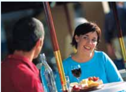
At Salamanca in Hobart

Take ten days to combine Tasmania's best wine and food with some of the State's most famous attractions, from Port Arthur to Cradle Mountain.