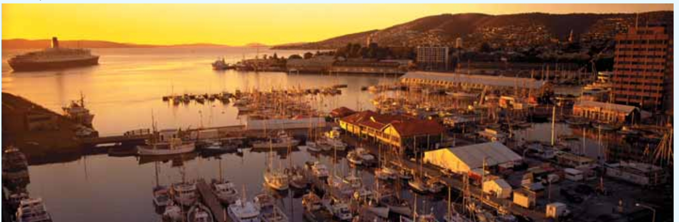
The port of Hobart

Spend one or two days exploring Wine South Tasmania by choosing experiences from the suggested three-day itinerary on page 3. If time permits, visit the Royal Tasmanian Botanical Gardens . Extensive plantings of Tasmanian and exotic flora, including the Macquarie Island plants in the fascinating climate-controlled Subantarctic House , are a great introduction to the variety of flora supported by Tasmania's diverse habitats. Following your visit to the vineyards of the Coal River Valley, continue on to the Tasman Peninsula.