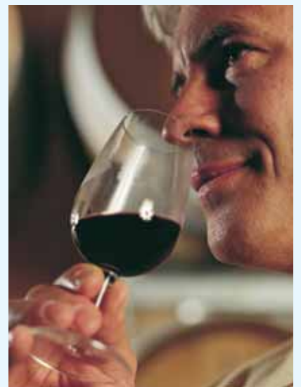
Tasting along the Tamar Valley Wine Route

Enjoy the best of Launceston and the Tamar Valley by selecting from the Three days of Tasmanian sparkling & pinot noir in the Tamar Valley itinerary (see page 2).