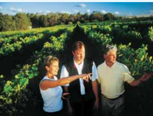
Tamar Valley vineyard

Taste award-winning pinot, riesling and sparkling along the Tamar Valley Wine Route , and dine at sensational restaurants (for full details see the three-day Tamar Valley option on page 2).