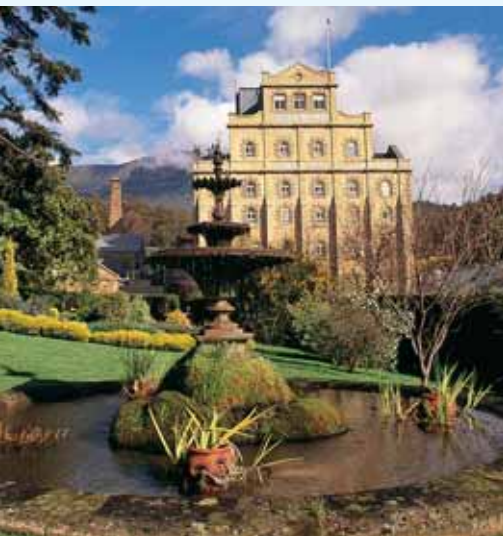
Cascade Brewery, Hobart

Cascade's imposing circa 1824 building in the foothills of Mt Wellington in South Hobart is the oldest operational brewery in Australia – fascinating tours and tastings are available from Monday to Friday. For dinner, try Lebrina , Restaurant Gondwana or Marque IV , recommended by Australian Gourmet Traveller's 2006 Australian Restaurant Guide.