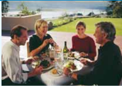
Lunch at Rosevears