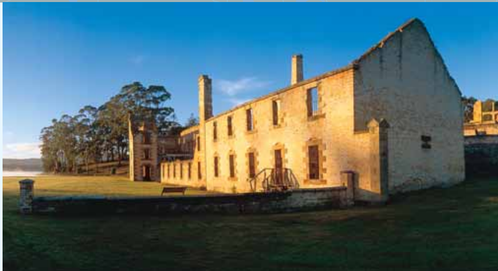
Port Arthur Historic Site

The journey is steeped in convict and colonial history, particularly the Port Arthur Historic Site . The magnificent scenery of this area also inspires photographers, bushwalkers, divers and rock climbers.