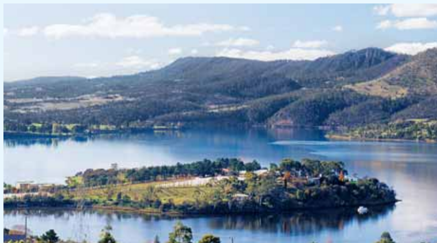
Moorilla Estate on the Derwent River, Hobart

On the way back from Richmond, detour past the airport to Barilla Bay Oysters for succulent shellfish (tours available) – perhaps sample them alongside a Coal River sparkling in the Barilla restaurant.