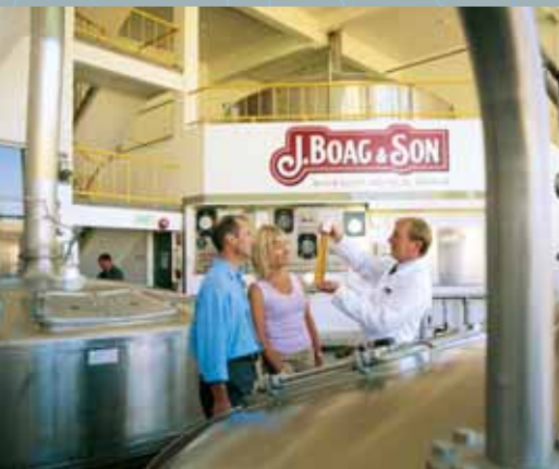
The secrets of world-beating ales!

Then perhaps visit the contemporary Queen Victoria Museum and Art Gallery at Inveresk. With an enviable reputation for its Australian colonial art collection, Inveresk also houses a rare collection of Tasmanian Aboriginal shell necklaces dating from the early 1800s.