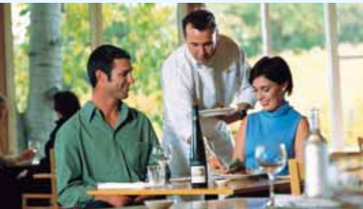
Dining at Daniel Alps at Strathlynn in the Ninth Island Vineyard

Tasmania is only a direct flight away from Sydney, Melbourne, Brisbane and Adelaide. Or take the maritime option – Spirit of Tasmania I or II sails from Melbourne to Devonport every evening, Spirit of Tasmania III from Sydney to Devonport up to three times a week.