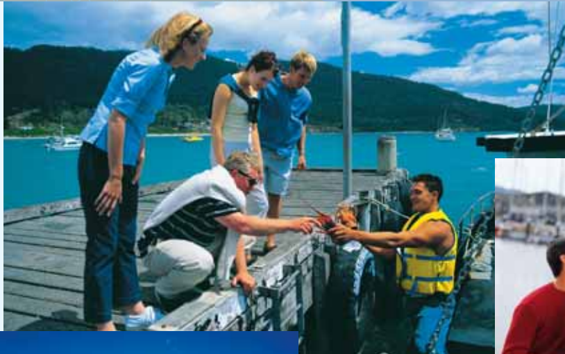
Fresh from the sea