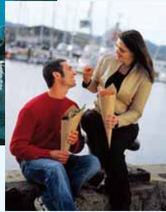
Fish and chips on Hobart's waterfront