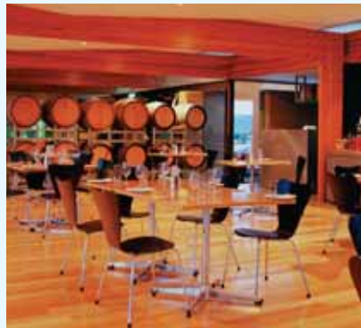
Home Hill Winery

For regional food with flair, lunch at Home Hill Winery , beautifully situated with vineyard and mountain views, or the waterside Peppermint Bay – both are architecturally stunning. Close by Peppermint Bay is Grandweve Farm Cheesery and vineyard , producing superb organic sheep milk cheeses and offering tastings and sales. Consider taking a break from the car and cruising from Hobart to Peppermint Bay, sipping Tasmanian wine or beer as you view marine life and salmon farms.