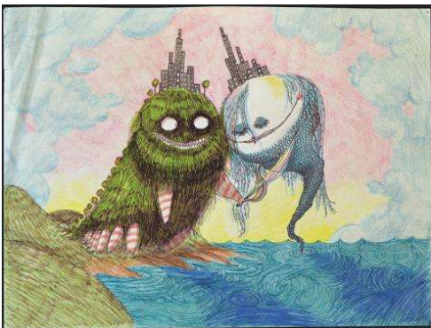
Untitled, Romeo & Juliet , Tim Burton

Tim Burton, Retrospective - LACMA May 29 to October 31, 2011