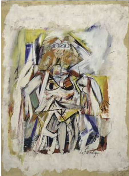
Willem de Kooning. Woman . 1950. Oil, cut and pasted paper on cardboard

De Kooning: A Retrospective - MoMA September 18, 2011 – January 9, 2012