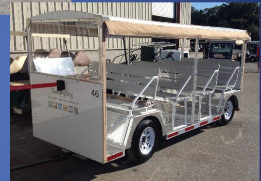
Para transit trailer