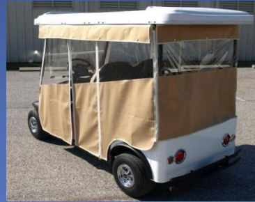
Sunbrella Roll down Enclosure