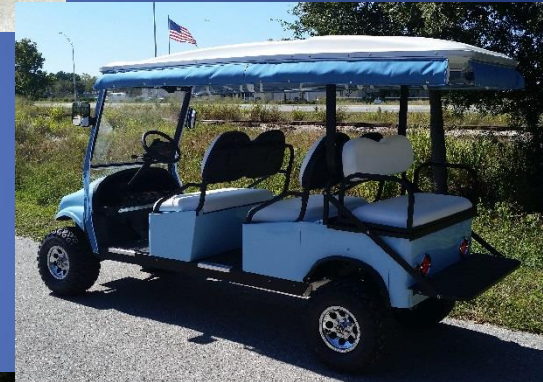
M6s Shown with Solar (s)