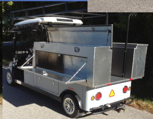
Reading Truck with work bench and Ladder Rack