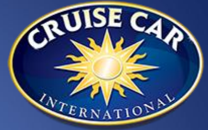
Cruise Car, Inc. World Headquarters Sarasota Florida, USA