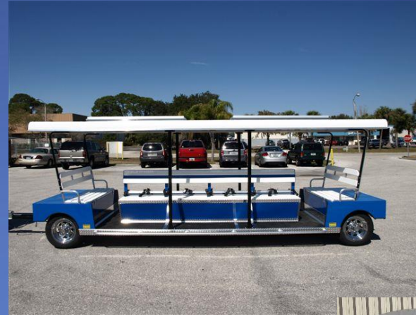
Custom 10-21 Passenger trailers