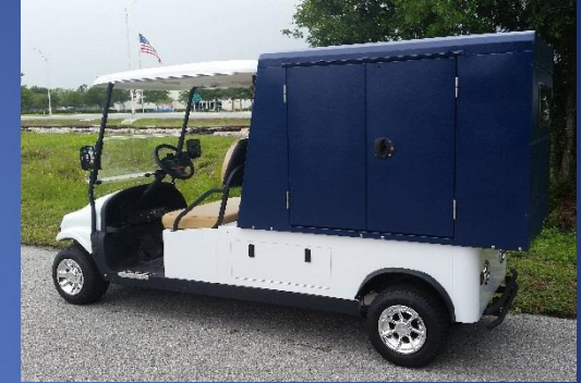
Cargo Van with Hard Doors