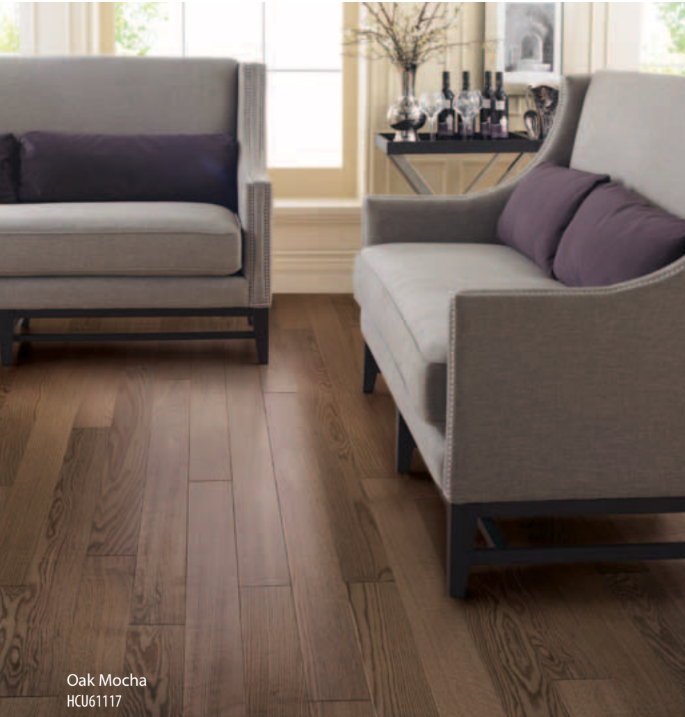
Oak Mocha HCU61117

The Summit Premier Collection endures in beauty and in performance. German-engineered precision is built in to every plank.