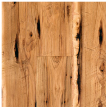
Natural Oil Pre-finish