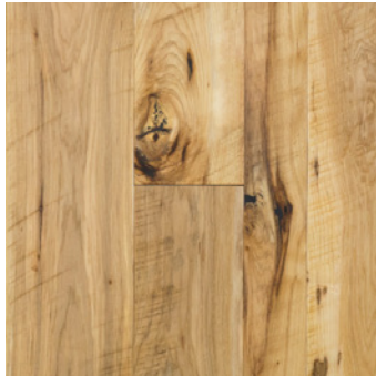
Water-based Polyurethane Pre-finish