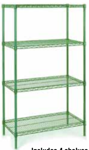
Includes 4 shelves & posts