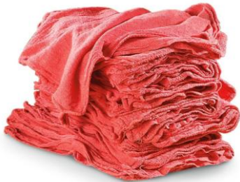
RED SHOP TOWELS