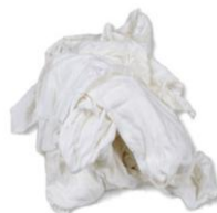
TERRY CLOTH REMNANTS