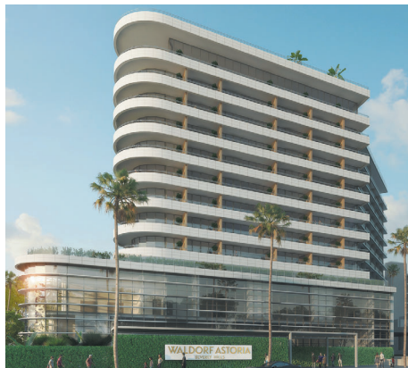
The Waldorf Astoria