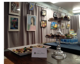
Art Exhibit "Art Through the Ages"