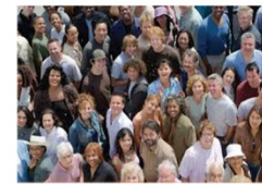
Community Social Work