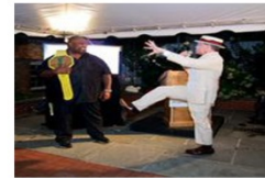
Fall Wine Tasting