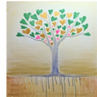
Giving Tree created by Maya Eilam