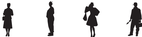
Neighborhood Captains (3-5 in a Precinct)