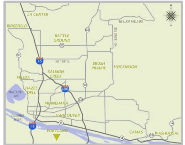
CLARK COUNTY HIGHWAY MAP

Strategically located along the I-5 corridor, transportation routes to the north and south allow for easy access to Seattle and California. Running east-west, I-84 serves as a portal to Eastern Washington/Oregon and Idaho. Freight can be delivered to California, Vancouver, B.C., and Idaho overnight from Clark County.