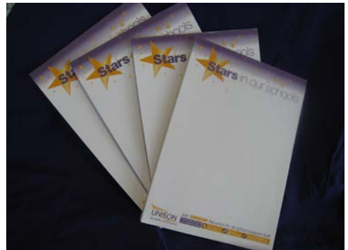
A5 note pads