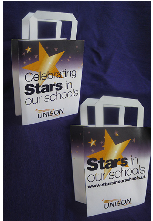
paper bags front and reverse side.