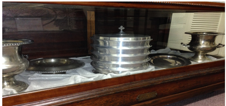
COMMUNION SET FROM THE 1800S

Our House Committee has been hard at work in our history room. We look forward to the room's completion, which will have pictures of all the pastors of the church. We invite you to go into the History Room and look at some of the church's history. The history room is located beside the food pantry in the hallway just to the east of the sanctuary.