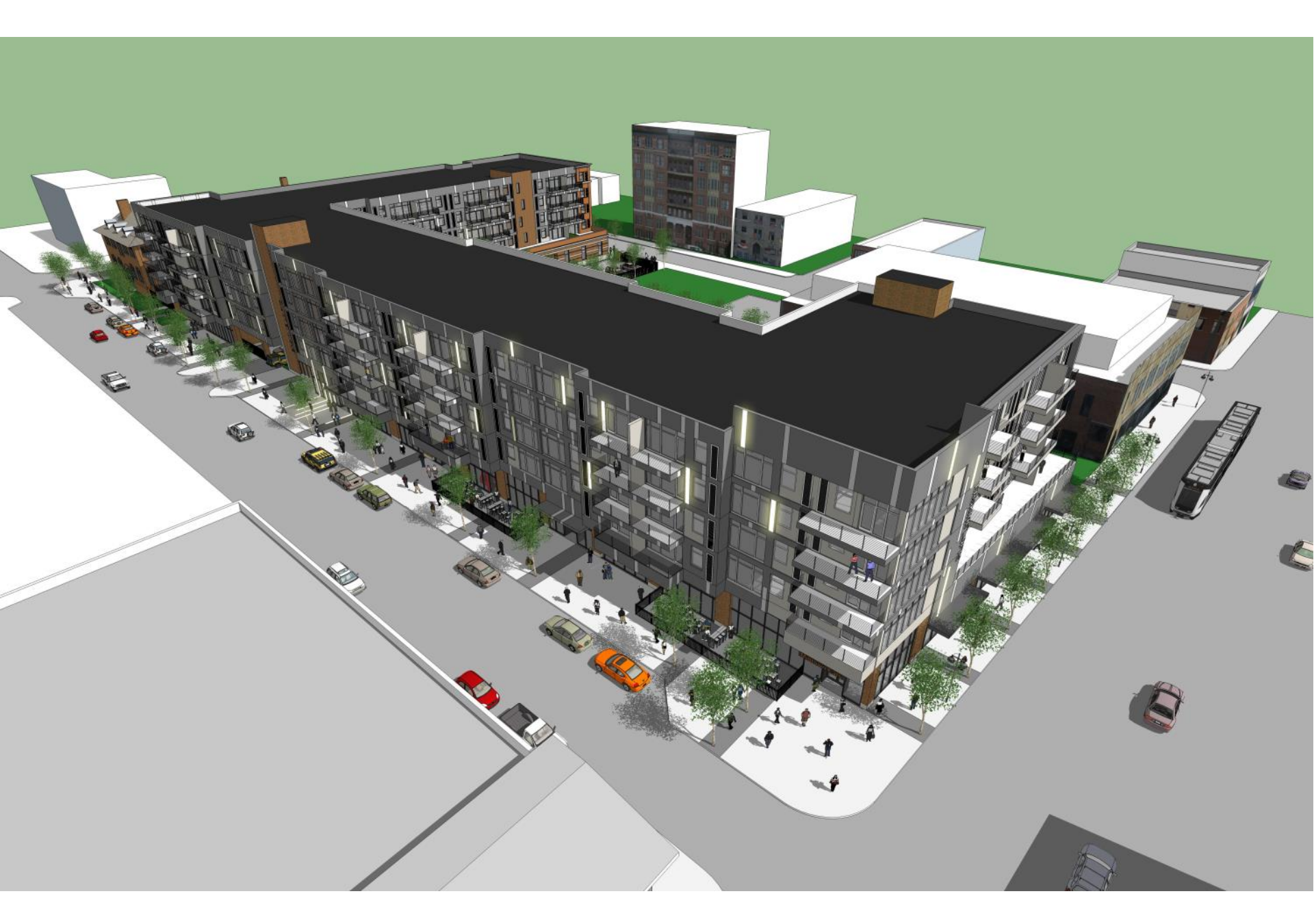
Aerial View looking Southeast