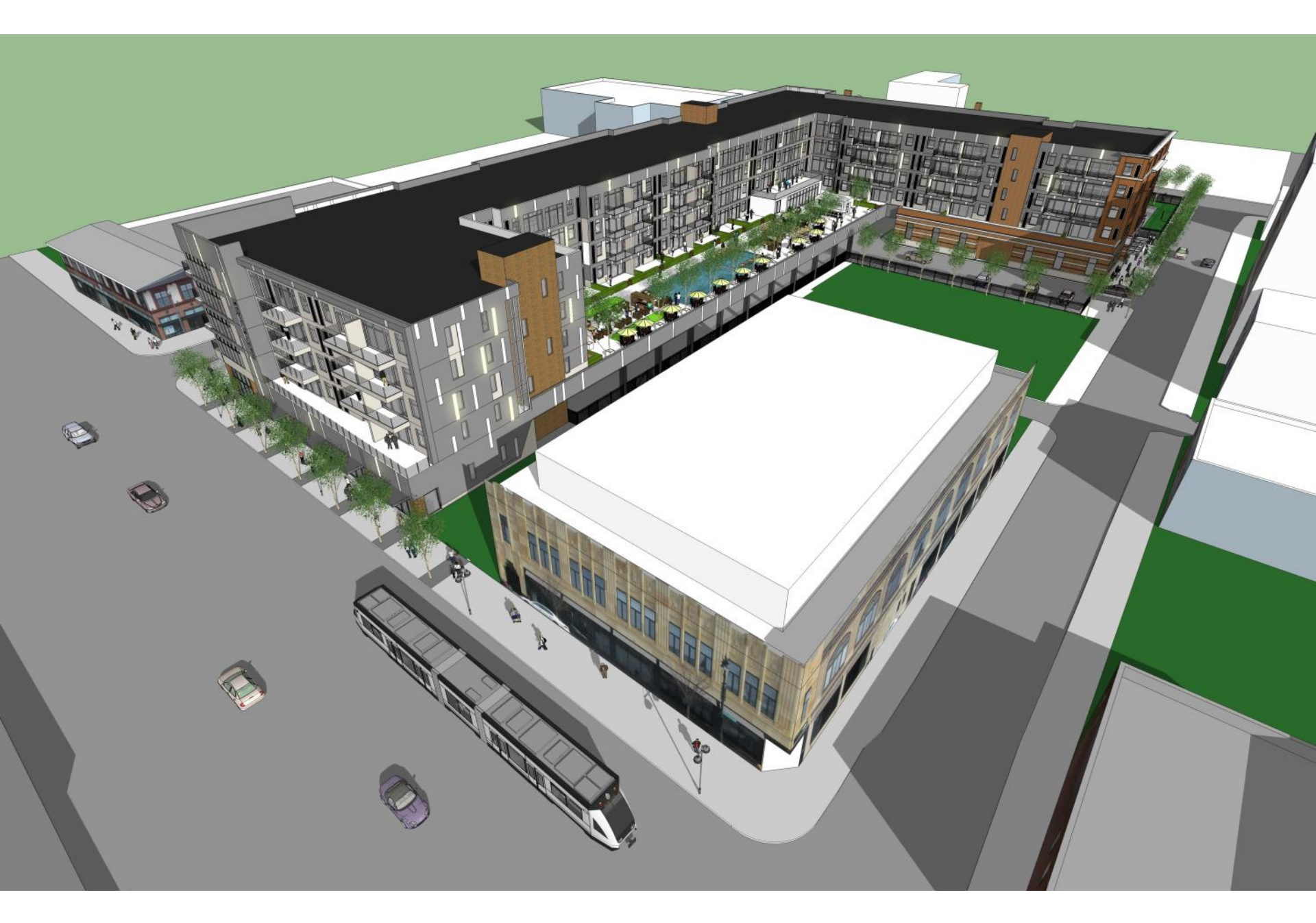
Aerial View looking Northeast