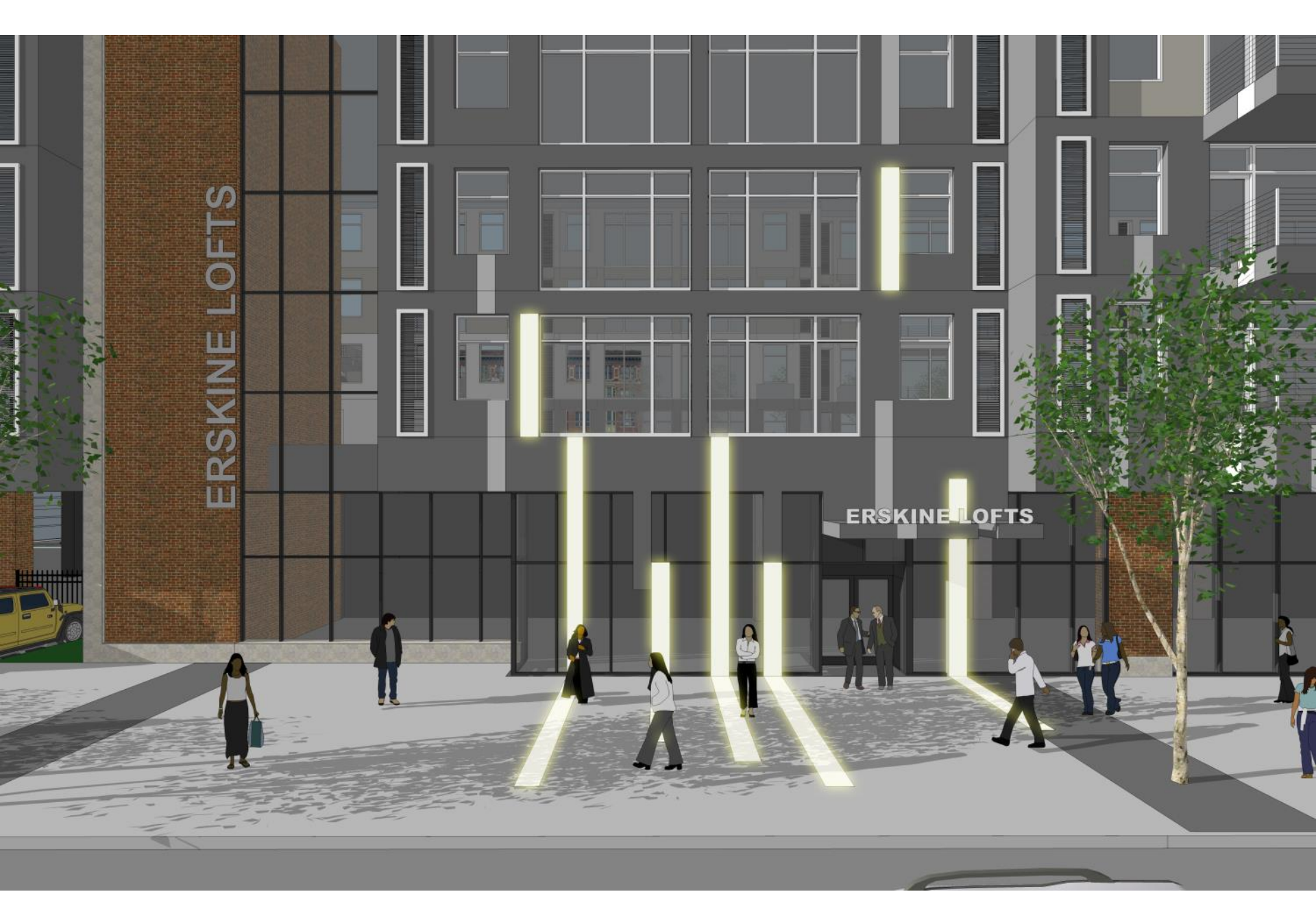
View of Apartment Lobby from Erskine looking South