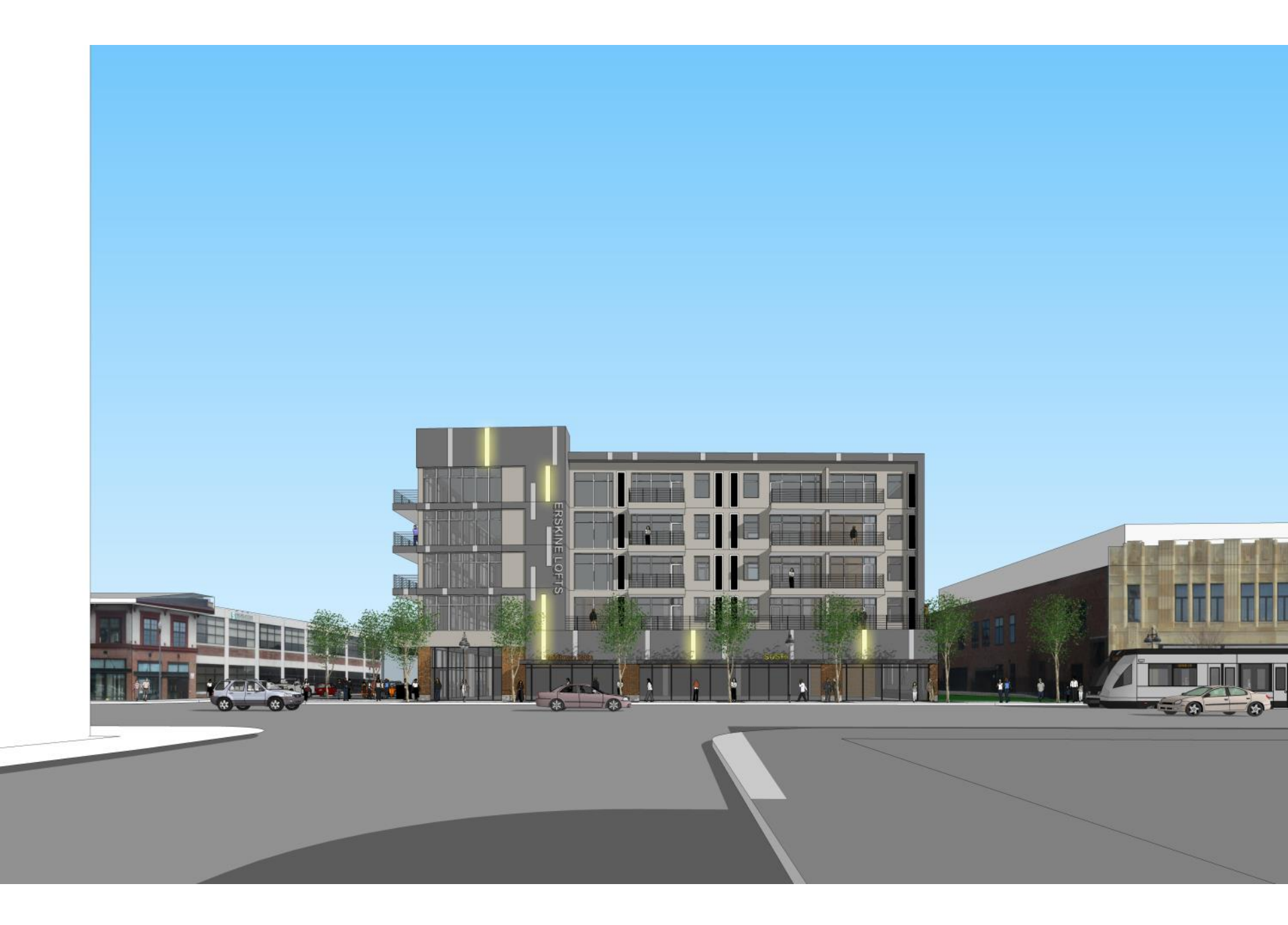
View from Woodward and Peterboro looking East