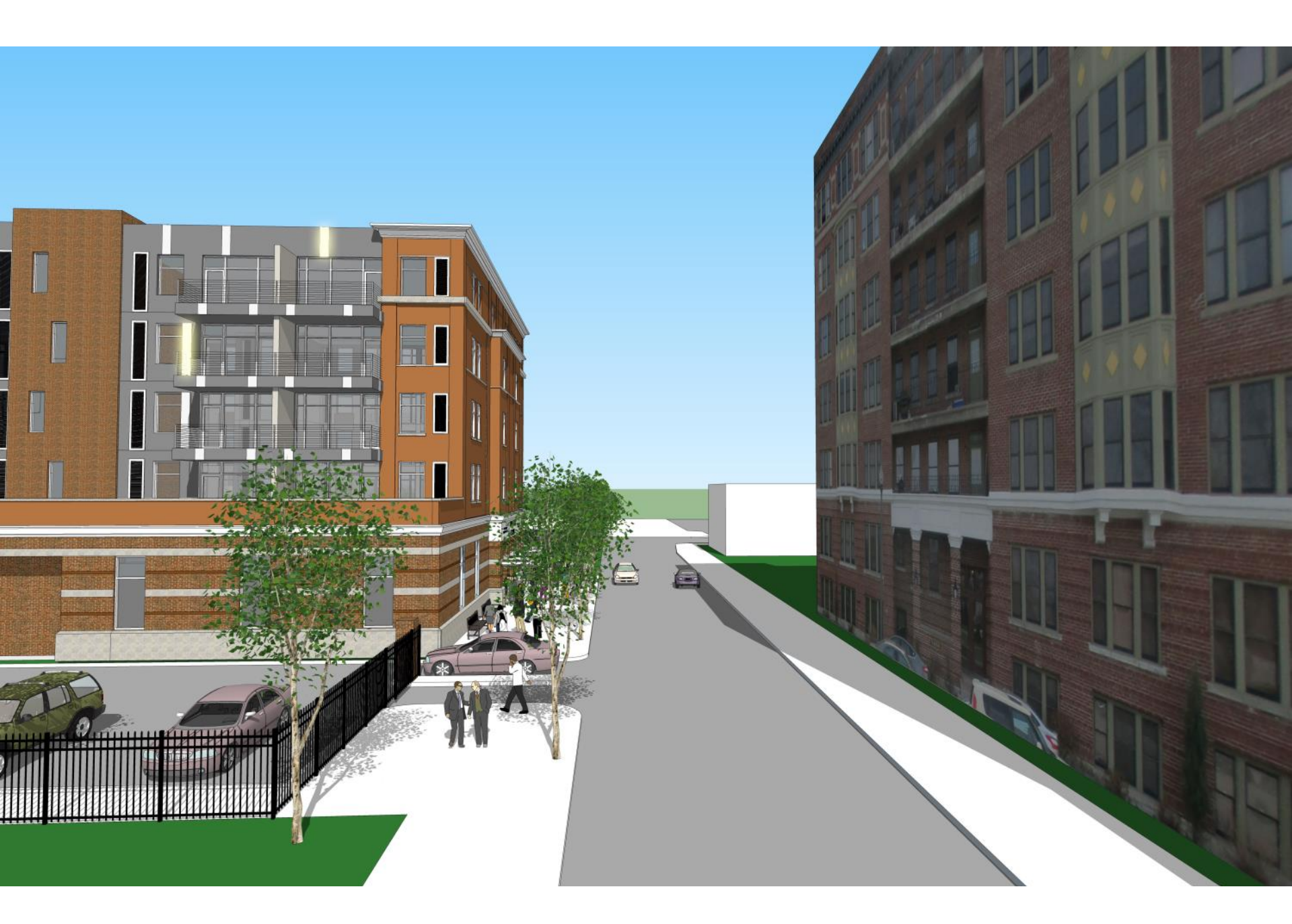
View from Watson looking East