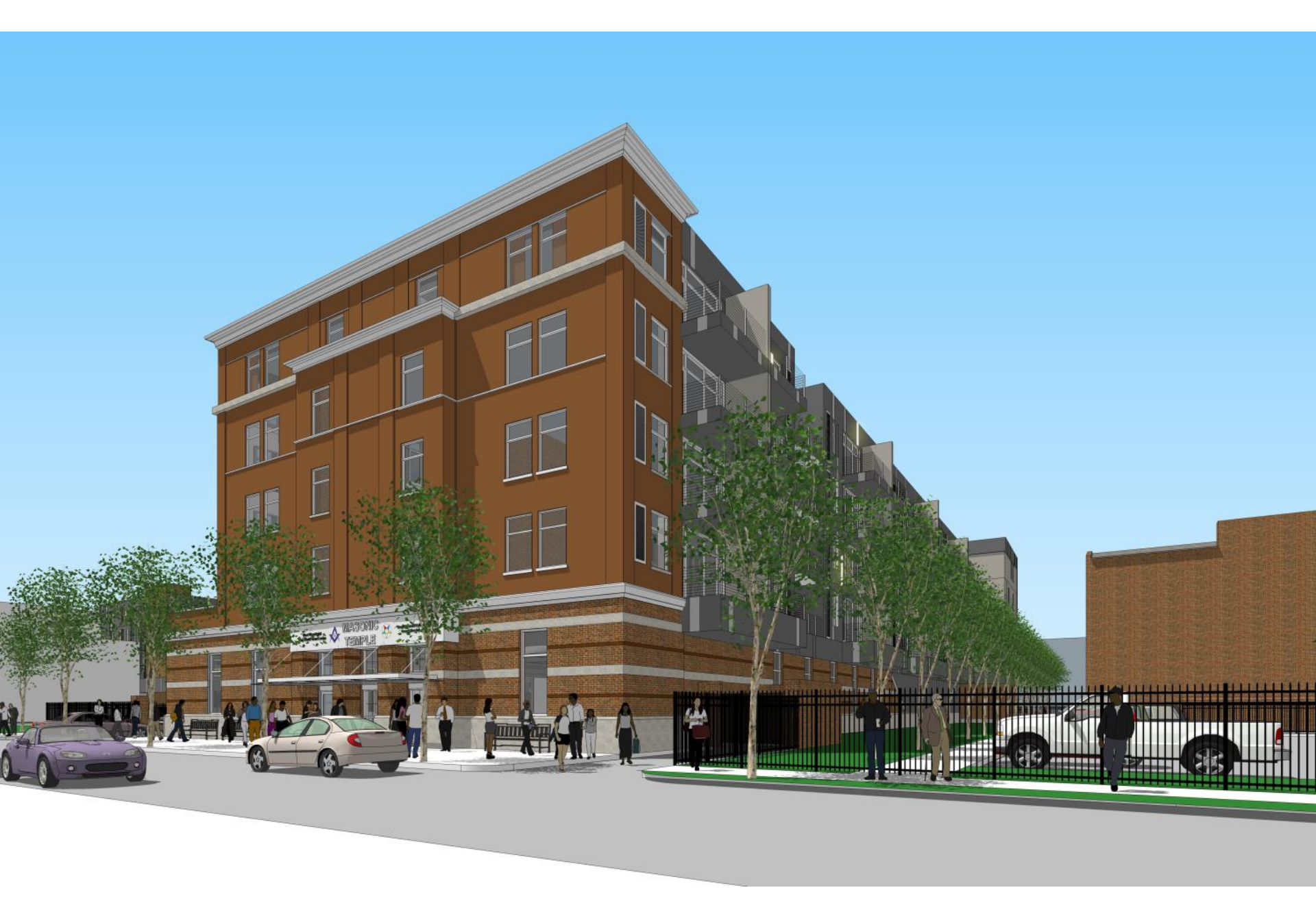
View of FCC from Watson looking North