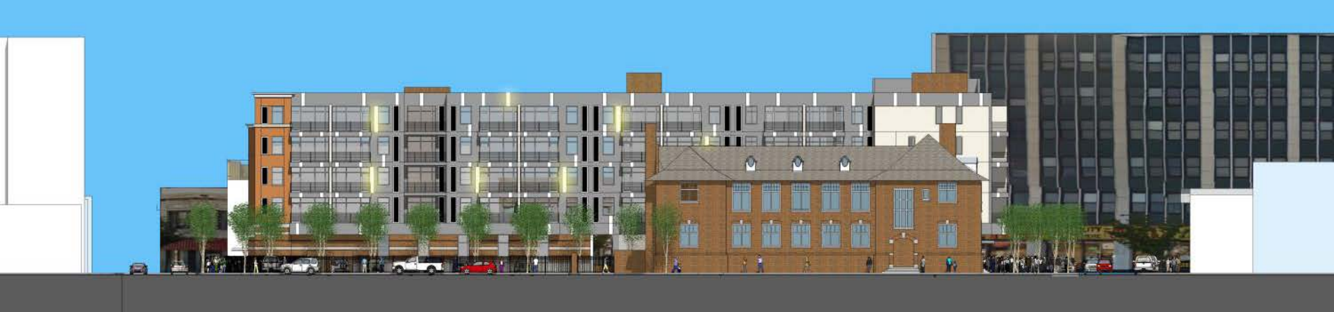
John R Elevation