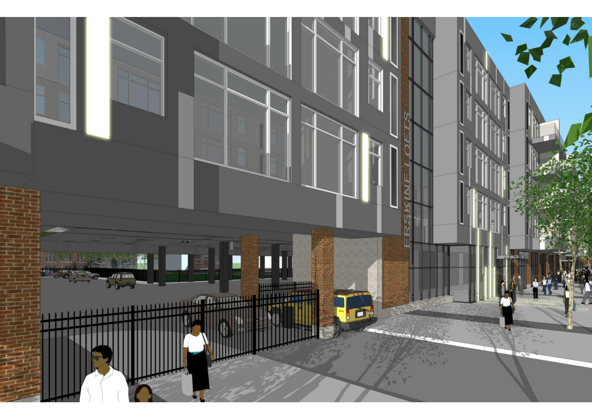
View of Parking Entry from Erskine looking Southwest