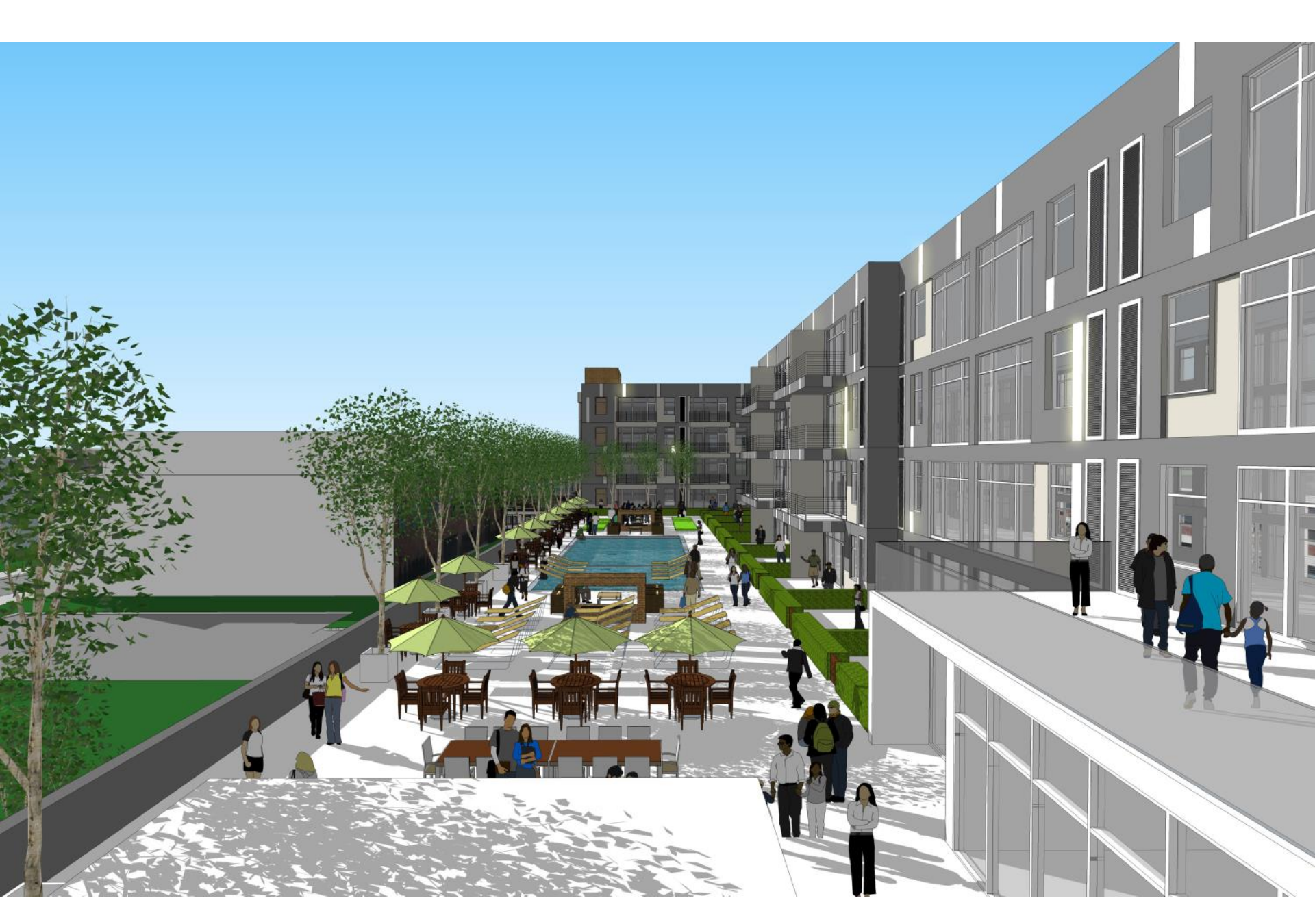
Aerial View of Roof Terrace looking West