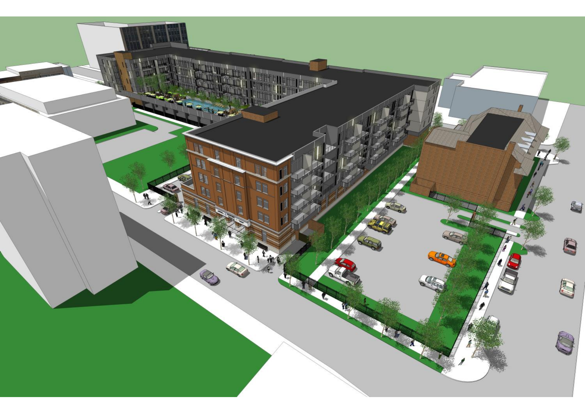
Aerial View looking Northwest