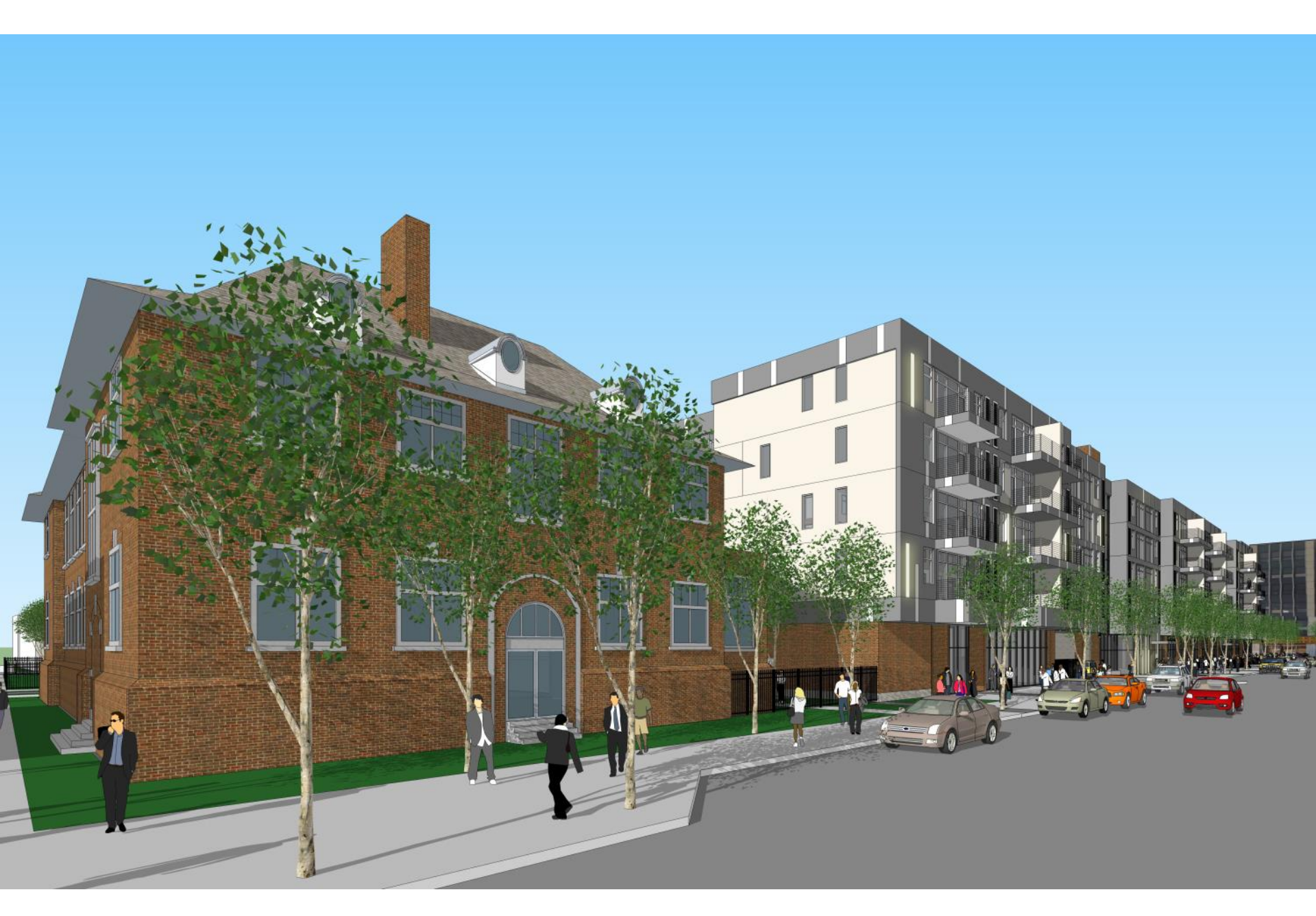
View from Erskine and John R looking Southwest