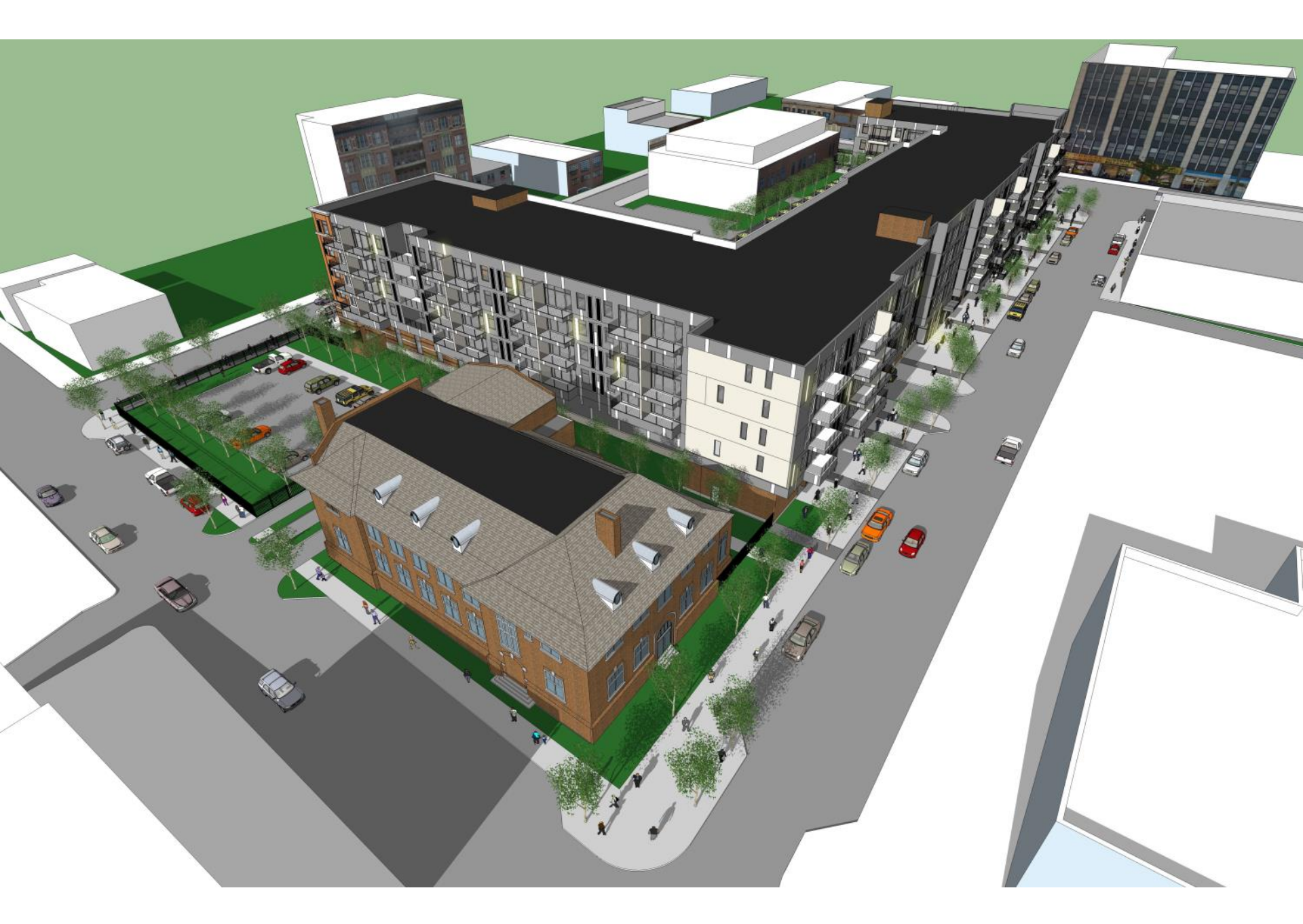
Aerial View looking Southwest