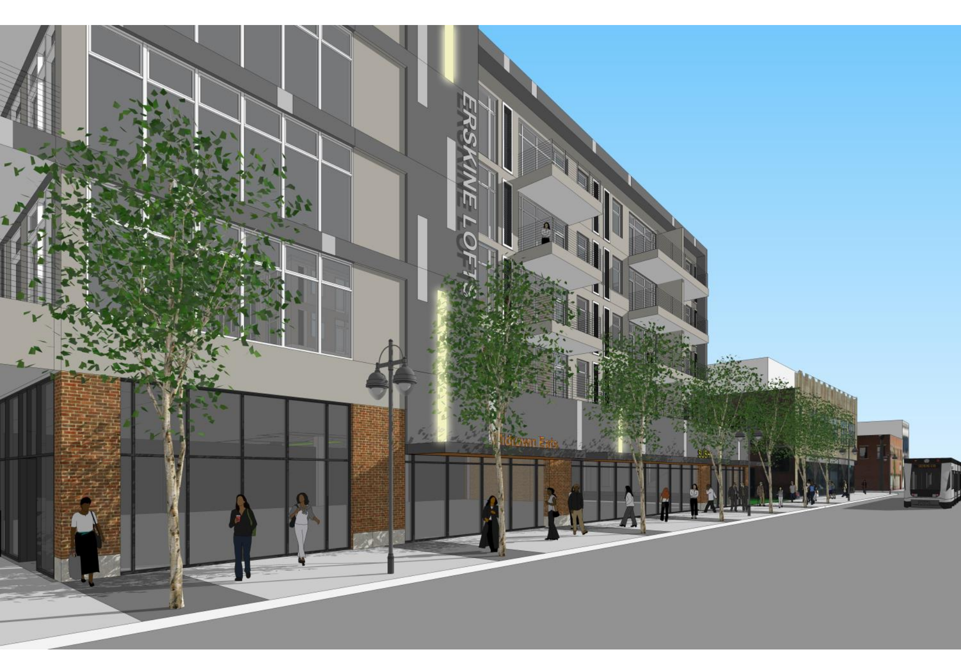
View from Woodward looking Southeast