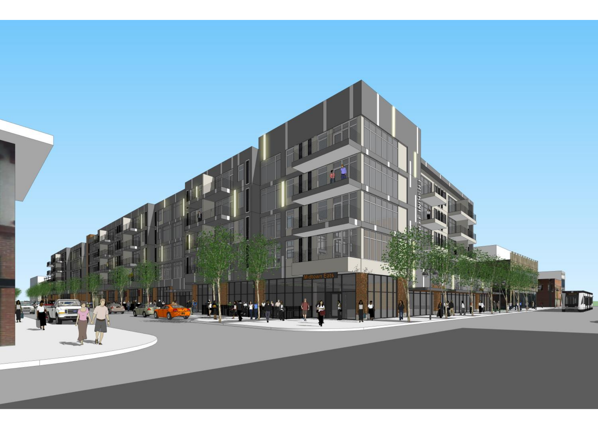
View from Woodward and Erskine looking Southeast