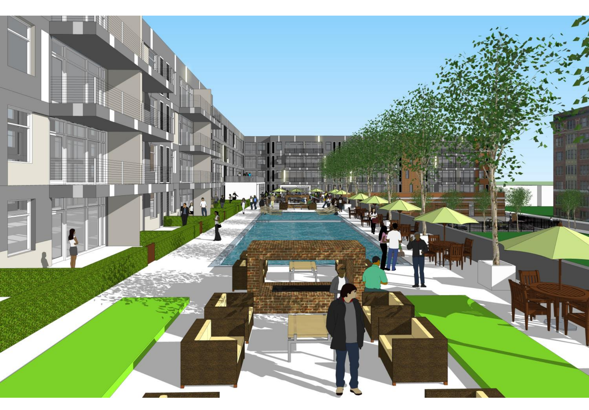
Aerial View of Roof Terrace looking East