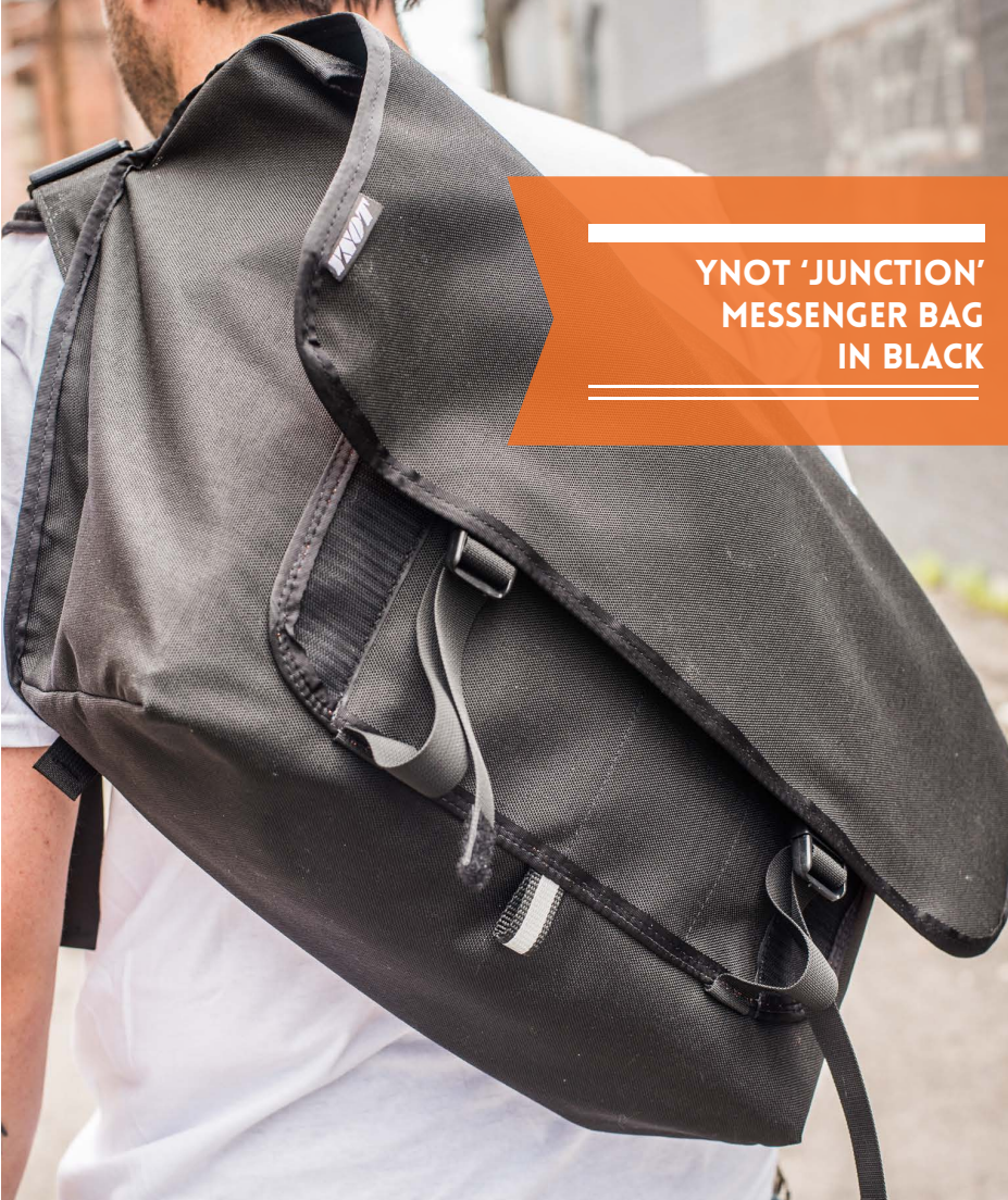
YNOT 'JUNCTION' MESSENGER BAG IN BLACK