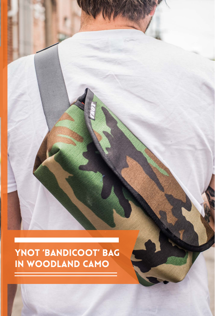
YNOT 'BANDICOOT' BAG IN WOODLAND CAMO