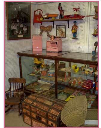
Toy Display, 2015. You have to see this!

our kitchen collections as Becky Hovde assembled a display of toasters and waffle makers. Currently, we are featuring Chicken BBQ time. What would you like to see displayed?