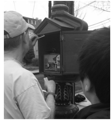
Putting the time capsule in a call box.