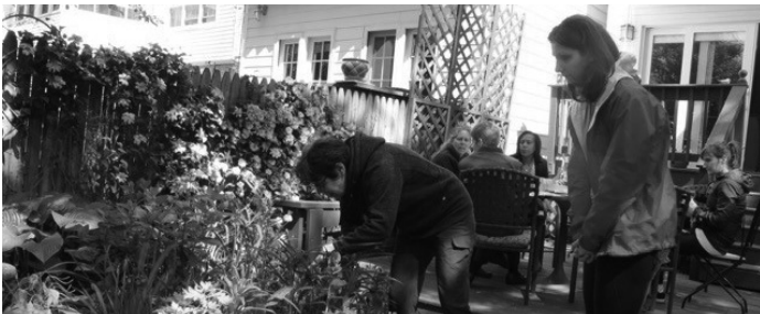
Admiring the lush garden.

Did you know that you can get logistical and financial help in making your garden more environmentally friendly? DC's Department of Energy & Environment has established the RiverSmart program. This program, for homes, schools and businesses, helps participants reduce storm water runoff from their properties in part through gardening. For example, trees help to absorb water through their roots, and rain gardens are groupings of smaller plants that just love to soak up large quantities of water in low-lying areas (see the city-created rain garden at the Tunlaw & 37th Street intersection). RiverSmart will give you a choice of appropriate trees for your site, and offer a rebate for installing a tree or rain garden. Rain barrels, to hold water onsite for later use in watering your garden, are also available with a rebate. Similarly, RiverSmart offers rebates and advice on pervious pavement installation. Pervious pavers can replace concrete or slate, thus allowing rainfall to soak in rather than rushing out to foul the Potomac with whatever it picks up along the way. Several Burleith garden club members have already participated in the RiverSmart program, and recommend it.