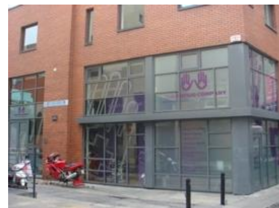
Outside the Clinic

There are a number of car parks within 5 minute walk of the clinic. We recommend Fleet Street Car Park, just off Westmoreland Street.