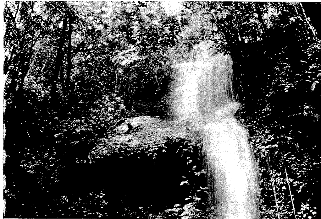
Figure 3.3. The surging foo— of So:lo : waterfall that climaxes Ulahi's gisalo song.

Singing like water is an idea that reverberates throughout Bosavi language and expressive practices. For example, the verb for "composing" in Kaluli, sa-molab , concerns hearing and singing inside, "like a waterfall in your head" as Jubi once put it. In this and other cases, the metaphoric potency of water is indicated by the polysemy of all water terminology to the semantic field of song. Composing a song is said to be like the way a waterfall flows into a waterpool. When the words come to your mind and fit the melody, it is like the way a waterfall flows into a pool, holding, bonding, then flowing away. Recall also that the central portion of the gisalo song, where its tonal center is established, is called the "waterfalling." This is where it echoes to establish an "o" calling out and