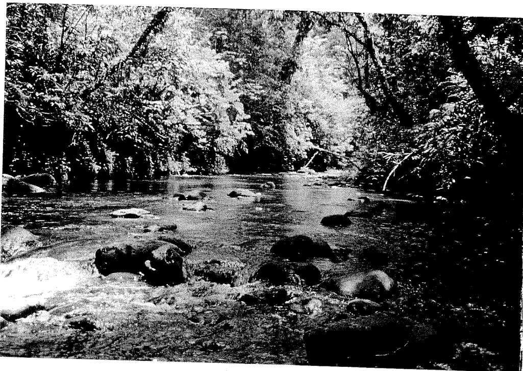
Figure 3.2. Gulu creek; water flows through land as voice flows through the body.

and anchoring in place. These ideophones fuse the sensation of water falling from above to below, pulsing outward from the pool at the bottom, flowing off and away, and spraying off both rocks and the water's own surfaces. Directly creating the spatial feel of waterfall presence, this phonesthesia of flow equally evokes time, through the sensation of water connection and movement. In addition to fusing this sensate space-time, the sa-sundab section draws the song to a close with a placed parallelism, linking together the two main creeks, the So:lo: and the Kida:n, which run parallel, ida:ni gali:ali , to join the Wo:lu, substantially defining important connections for Bono: people living at Bolekini. The song then ends with a single droning of the sa-gulu , the flowing open "o" that carries the song off with the water as Ulahi's voice fades.