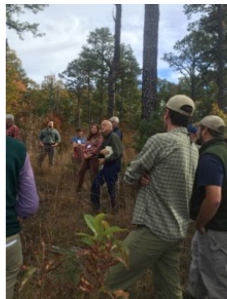
Great discussions on "what to do next"