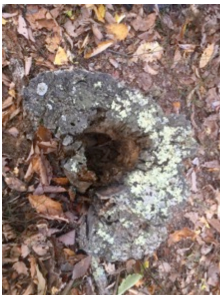
Fire Scarred Table Mountain Pine sampled by Henri