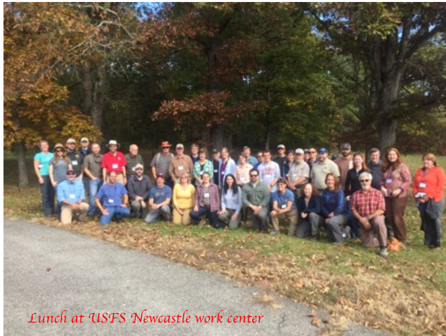
Lunch at USFS Newcastle work center

We had a great joint workshop with the Central Appalachian Fire Learning Network in October. If you couldn't make it to the workshop but are interested in viewing the PowerPoint presentations you can find them posted under the event on www.appalachianfire.org .