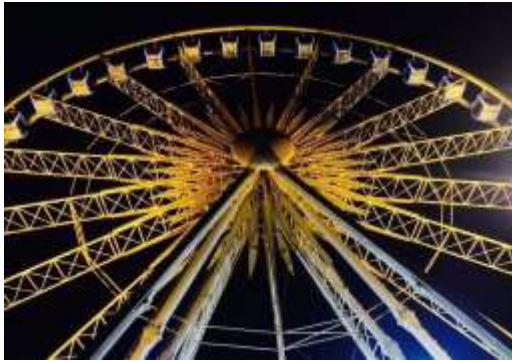
The Brighton Wheel, in the U.K. lit orange for Color The World Orange™ 2015