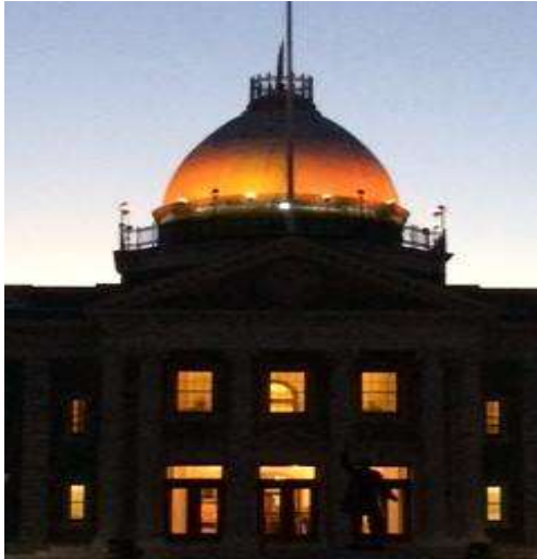
Nassau County, N.Y. Executive Building lit orange for Color The World Orange™ 2014